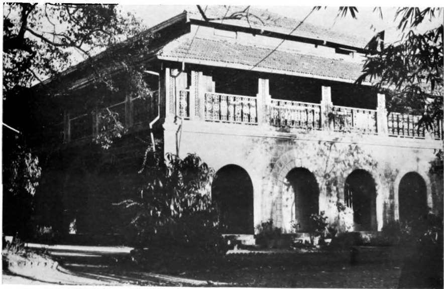
Servants of India Society, Pune. Library Building (Side view)