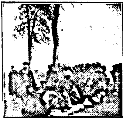
Abors with the gift of utensils.