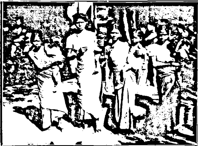
Nursing mothers receiving milk at Madras.