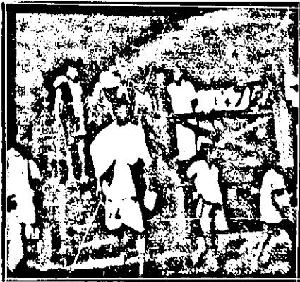
Some of the sufferers at Sadiya