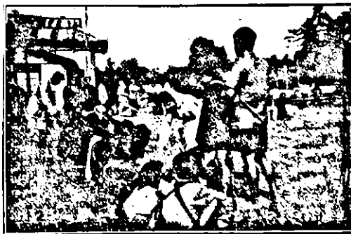
Distribution of food to Mishimi tribesmen who had already received cloth.