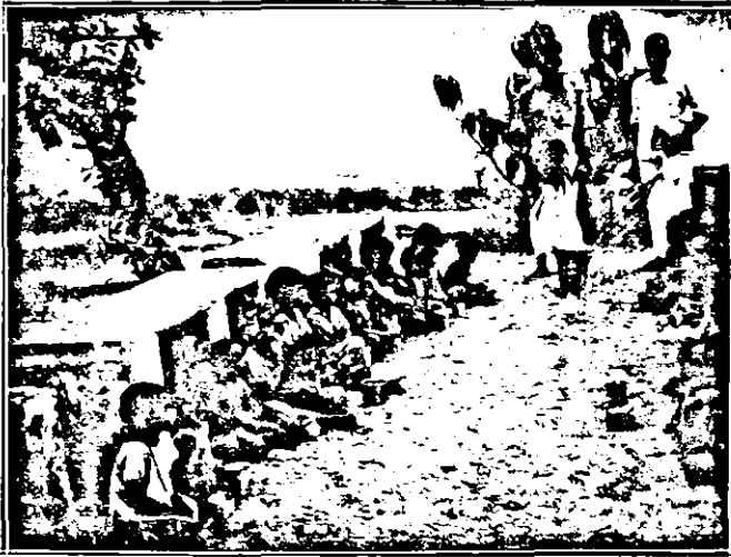
Milk distribution on the premises of the Servants of India Society at Madras.