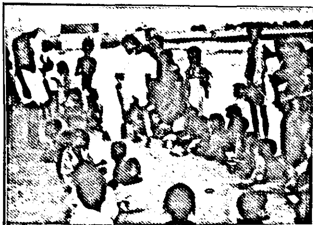
Distribution of milk to children at Pochiwalkam.