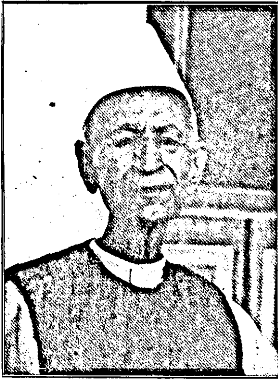
THAKKAR BAPA as he looked on 24th June 1950.