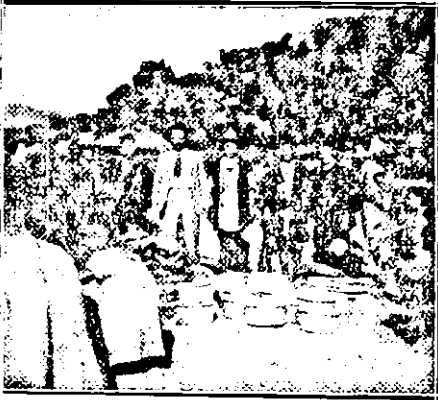
Disposal of relief articles in the interior of Abor Hills.