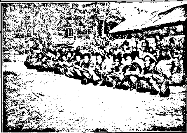
Mishimis waiting to receive relief articles.