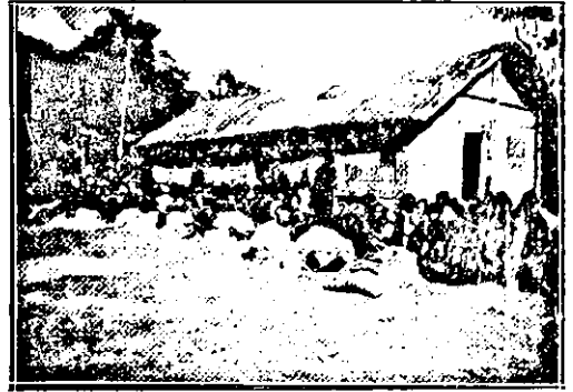
Mishimi tribesmen, having received cloth, waiting for other relief articles.