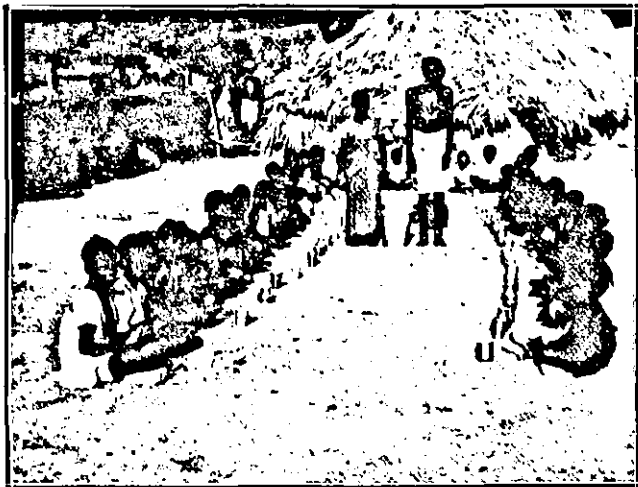
Milk distribution at Valaipuram.