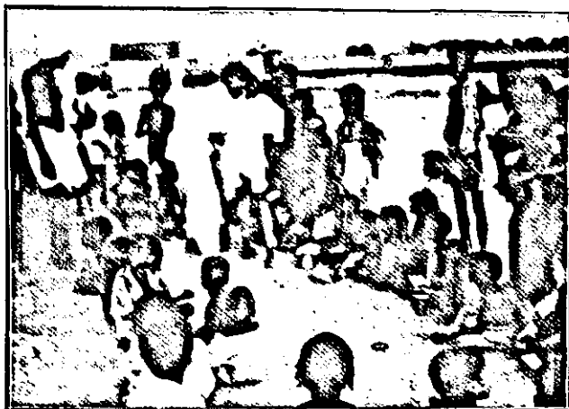
Distribution of milk to children at Pichiwalkam.