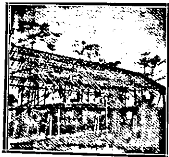
A Miri tribesman's hut under reconstruction.