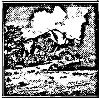
A typical view showing landslides due to earthquake.