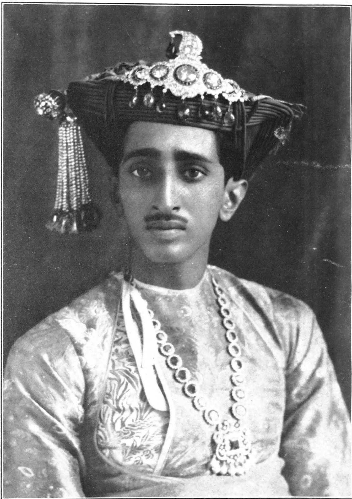
His Highness Maharajadhiraj Raj Rajeshwar Sawai Shri Yeshwantrao Holkar II of Indore.