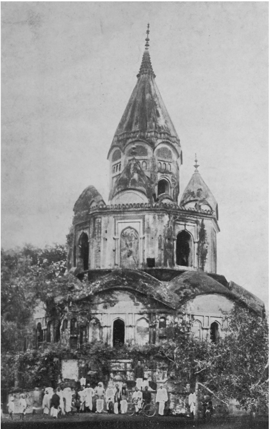
SATARA RATNA TEMPLE.