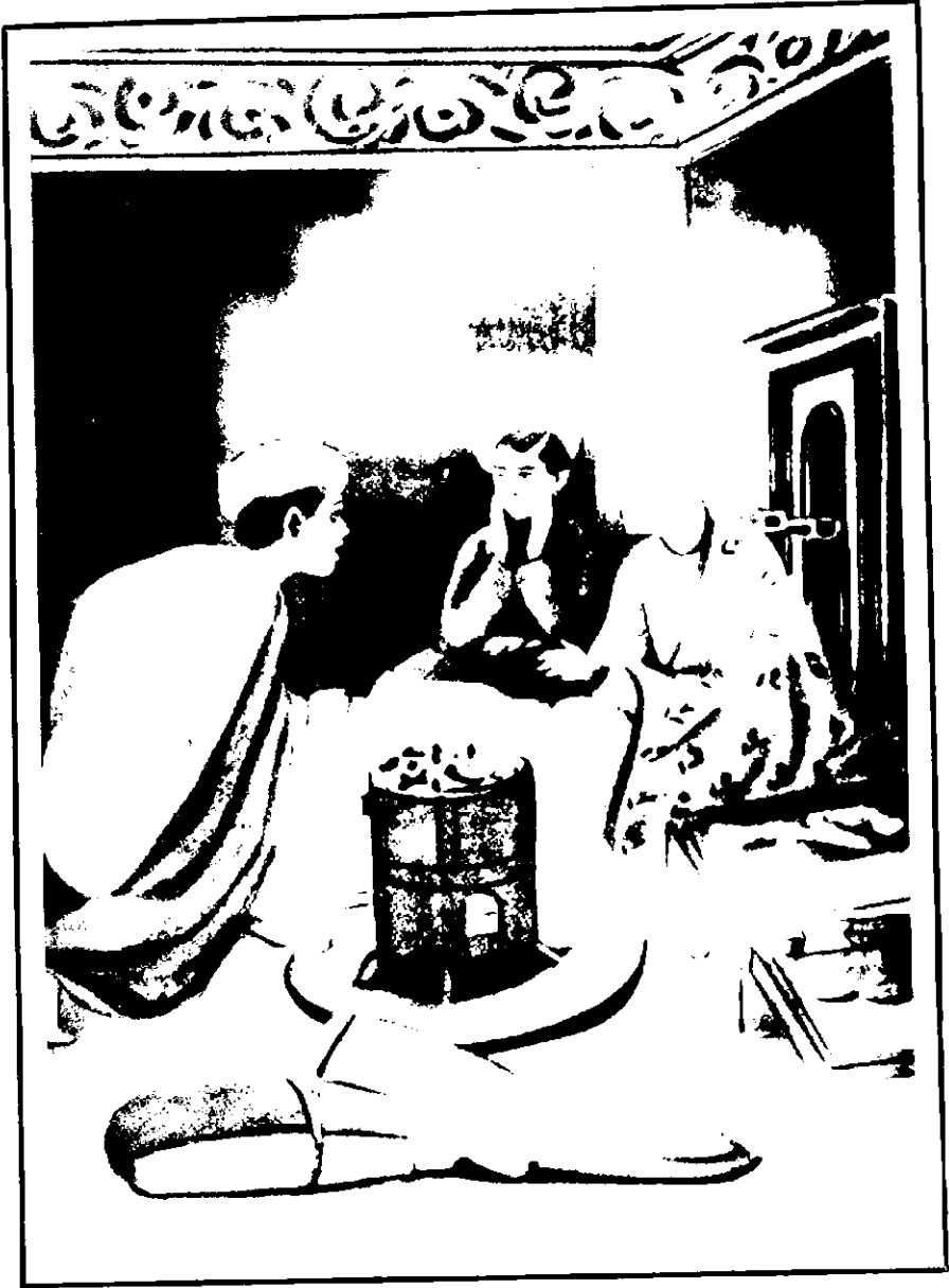
A BANKER'S OFFICE