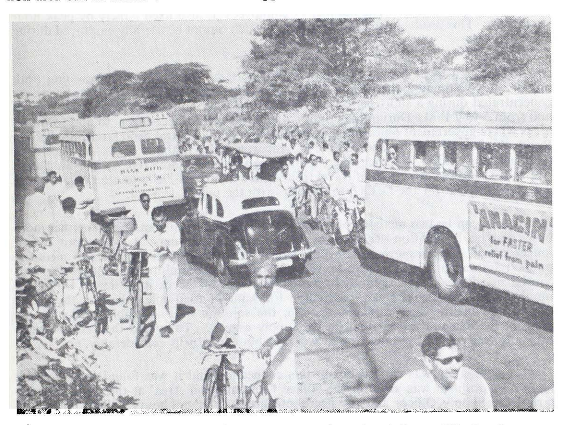
During rush hours cycle traffic on many roads makes it impossible for the buses to operate efficiently

As may be seen from the desire lines map of Delhi (Appendix I), heavy volumes of traffic by buses and cycles originate from 'zone 31-Lody Colony', 'zone 4 Subzimandi area', 'zone 15-Gole Market area', 'zone 8-Rajendra Nagar area', 'zone 11-Chandni Chowk area', 'zone 12-Daryaganj area', 'zone 14-Paharganj area', 'zone 13-Minto Road-Ranjit Singh Road', 'zone 25-Moti Bagh area', 'zone 38-Malaviya Nagar', 'zone 30-Nizamuddin and Bhogal', 'zone 40-Shahdara', 'zone 23-Najafgarh area' and 'zone 10-Qutab Road area'. The volumes of traffic from other zones to the office concentration area can be seen from the table in Appendix III.