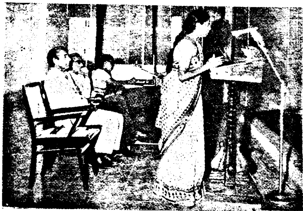
DEBATERS IN ACTION —Speaking for and against the proposition.