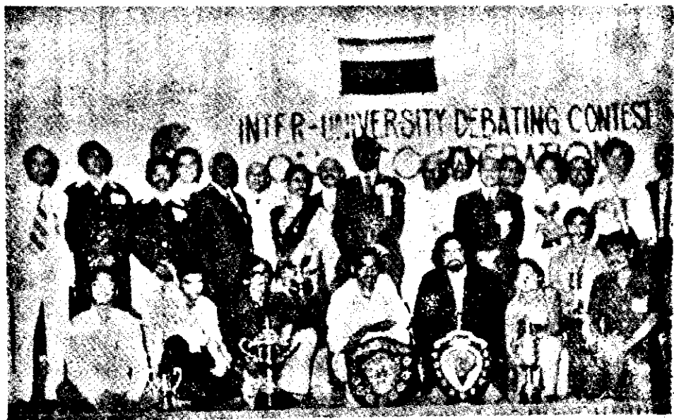
PRIZE WINNERS — Prize winners with the distinguished guest.