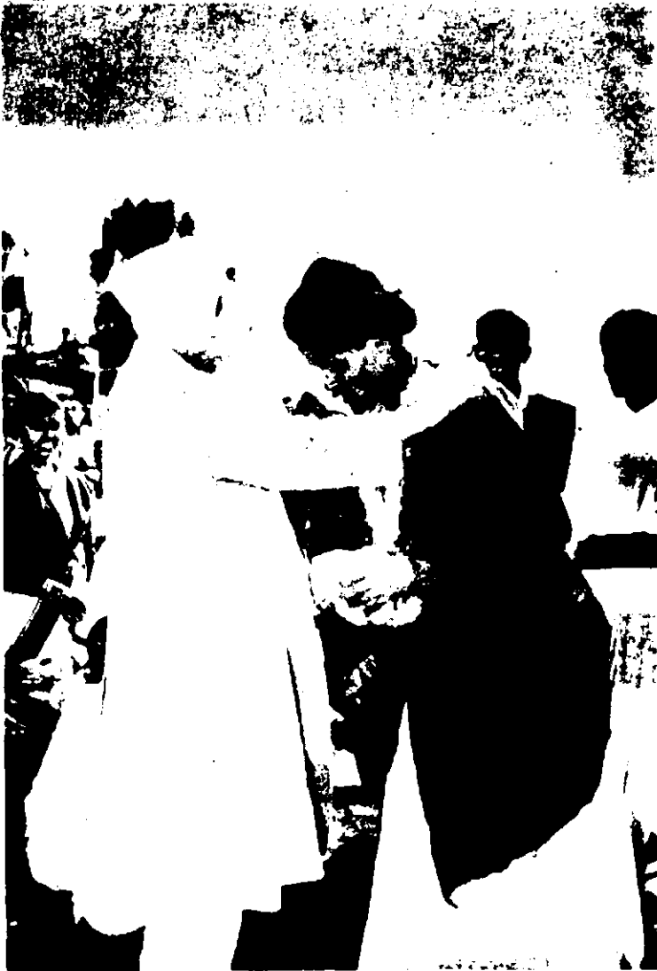
The Governor of Madras garlanding an Adivasi at the Exhibition