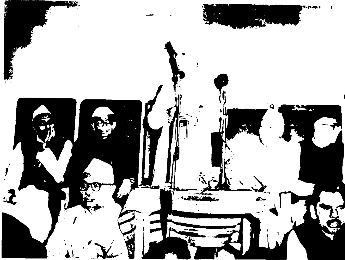
Dr. S. Radhakrishnan, Vice-President of India, inaugurating the Conference