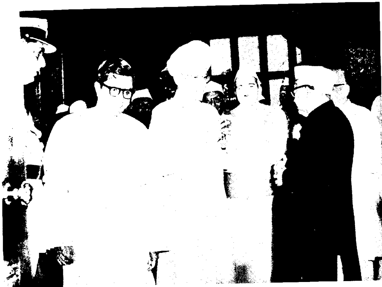
Dr. S. Radhakrishnan taking leave of leaders after the Conference