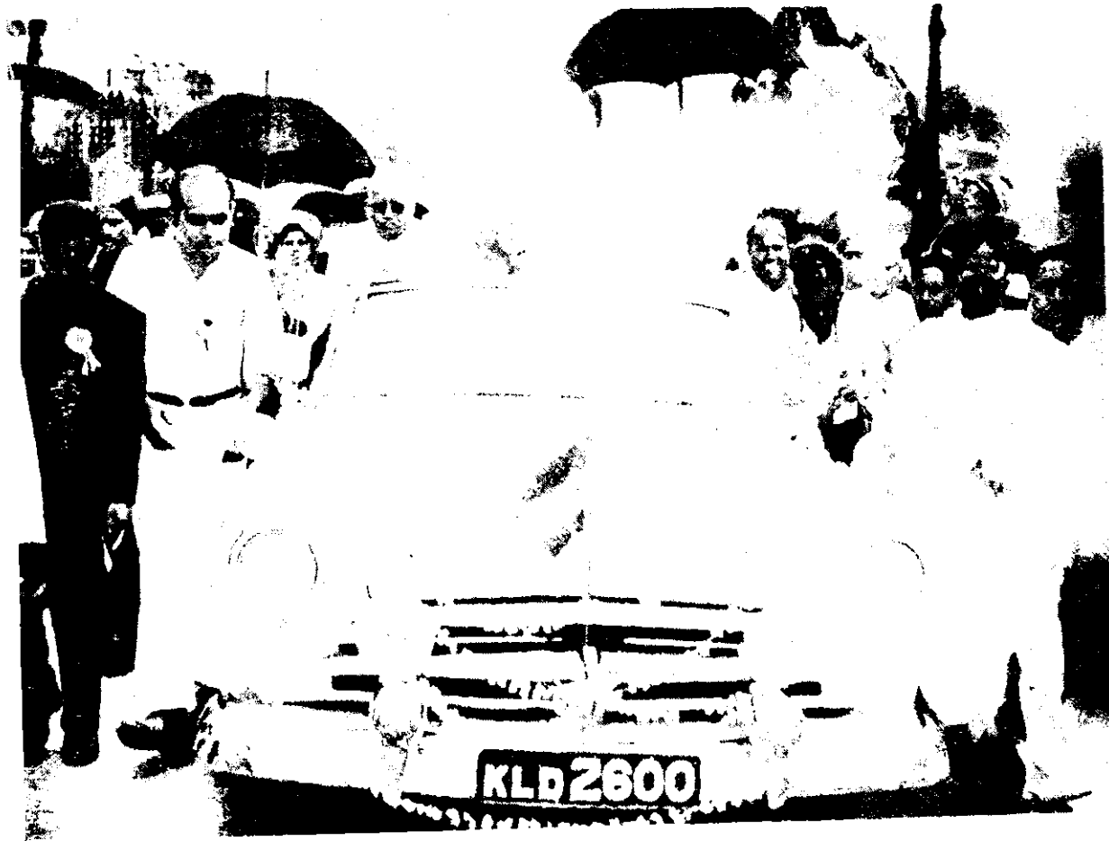
Dr. S. Radhakrishnan, Shri B.R. Medhi and Shri U.N. Dhebar being taken in procession in Ootacamund