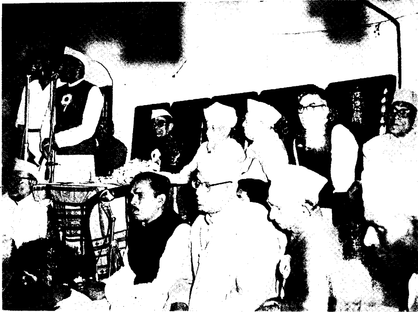
Shri U.N. Dhebar addressing at the inauguration session of the Conference