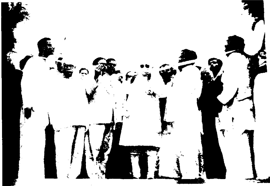
The Governor of Madras opening the Exhibition