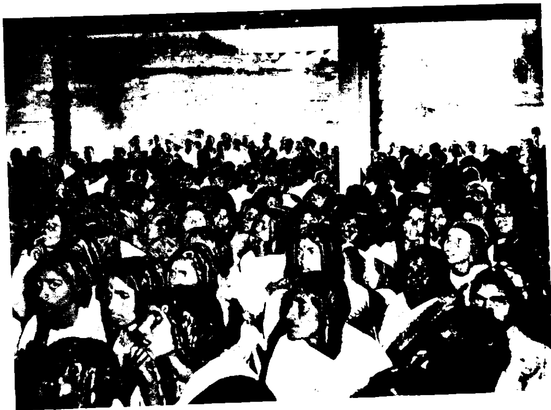
A view of Adivasis at the Opening Session of the Conference