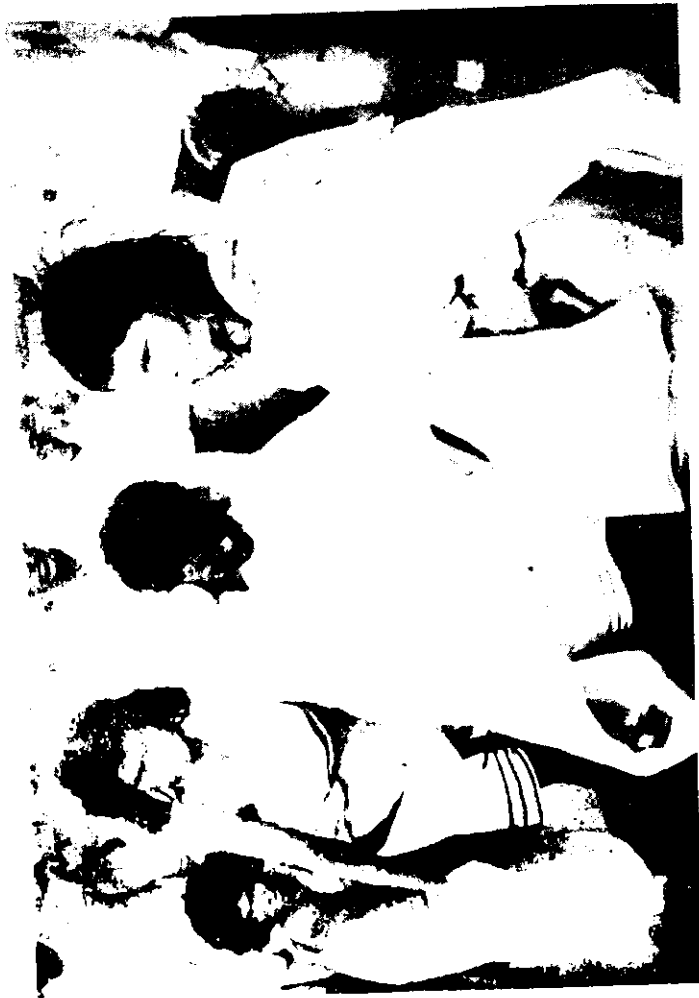
Paniyan Women of Nilgris