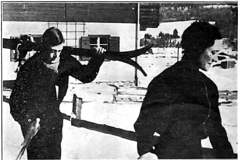
KING EDWARD, MRS. SIMPSON* In 1934 . . . Aunt Bessie was chaperon.

del School a richer girl, let it be known her name was no longer Bessie but Wallis.