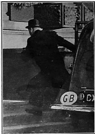
KING GEORGE TO BE* Two at a time.