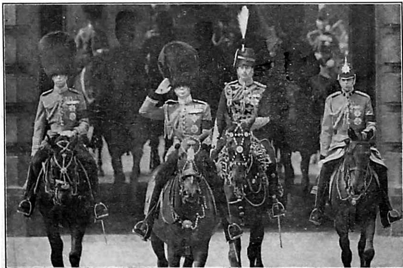
ALBERT, EDWARD, HENRY, GEORGE Brothers.

To King Edward at Fort Belvedere on Thursday morning came a last-minute radiogram from Roman Catholic