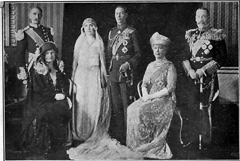
KING GEORGE, QUEEN MARY, ALBERT, ELIZABETH, EARL AND COUNTESS OF STRATHMORE Wedding day.

At Fort Belvedere Winston Churchill had arrived for lunch—the last politician to see King Edward. He stayed for three hours, helped Edward to write his final broadcast message to the British Empire and the world.