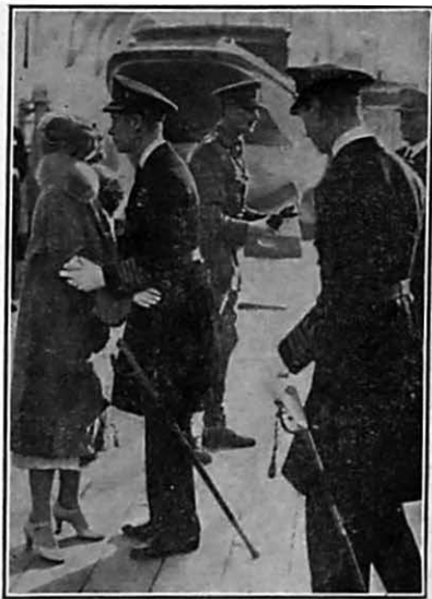
ELIZABETH, EDWARD, HENRY, ALBERT From a future King, a brotherly kiss

Three of the brothers—Edward, Albert and George—went into the Navy, the fourth—Henry—went into the Army.