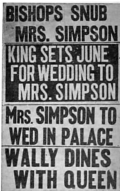
HEADLINES FROM FOUR AMERICAN NEWSPAPERS