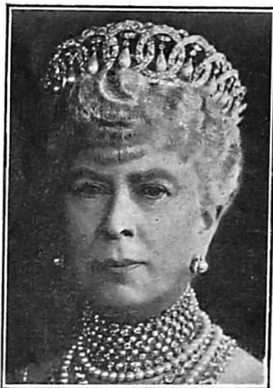
QUEEN MARY The sorrowing mother.

Albert, Duke of York, became King, taking the title George VI because Queen Victoria had asked that there should never be a King Albert because there could be no man as good as her Prince Consort.