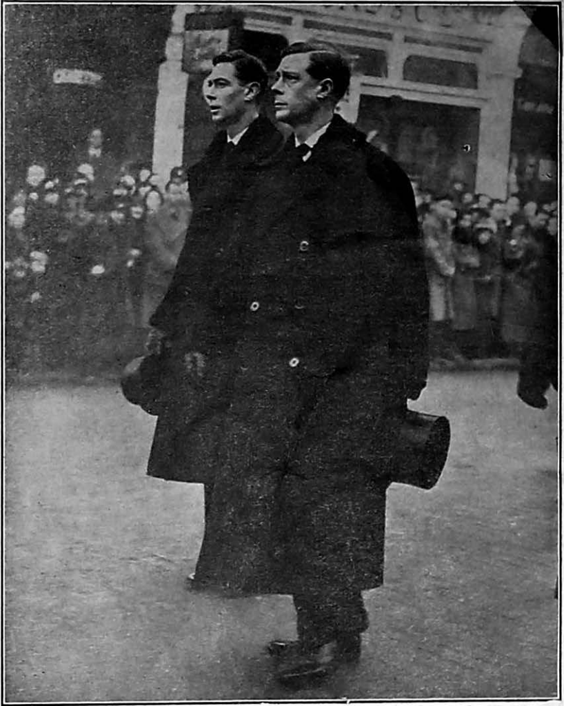
EDWARD, ALBERT* That day, just brothers.

From his room the Prime Minister talked to Fort Belvedere, arranged an interview with the King.