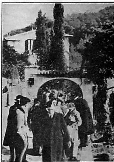
REPORTERS OUTSIDE THE VILLA LOU VIEI AT CANNES