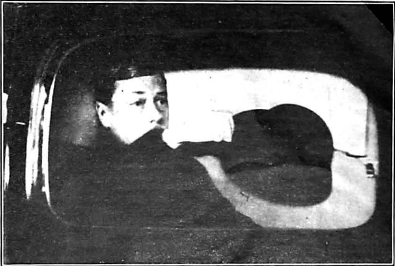
KING EDWARD* Hat off to crowd—for last time?