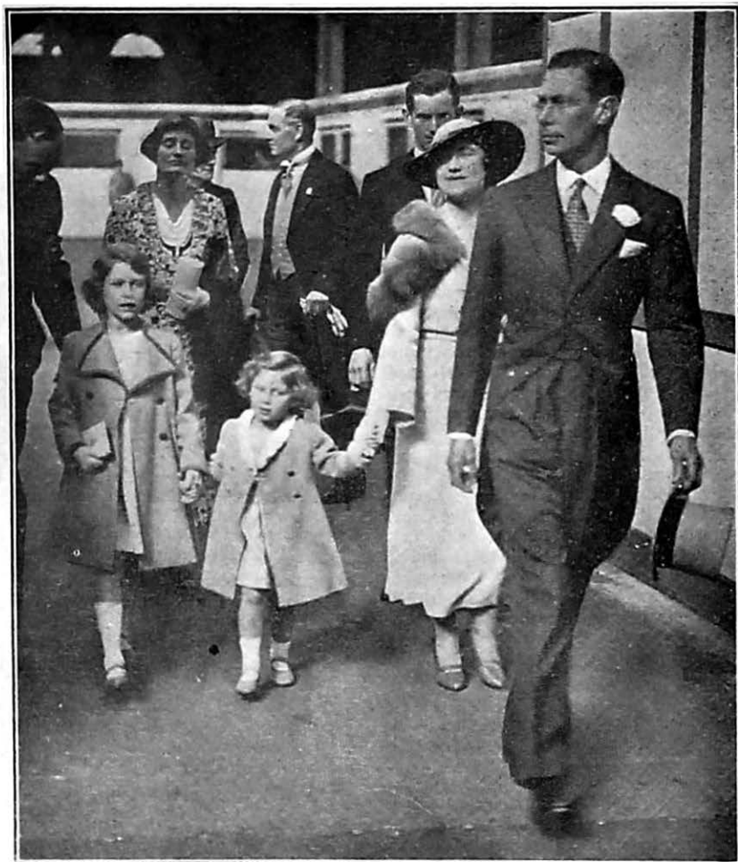
ALBERT, ELIZABETH, PRINCESSES ELIZABETH AND MARGARET ROSE For the throne, a family man.

York, the Duke of Gloucester, and the Duke of Kent.