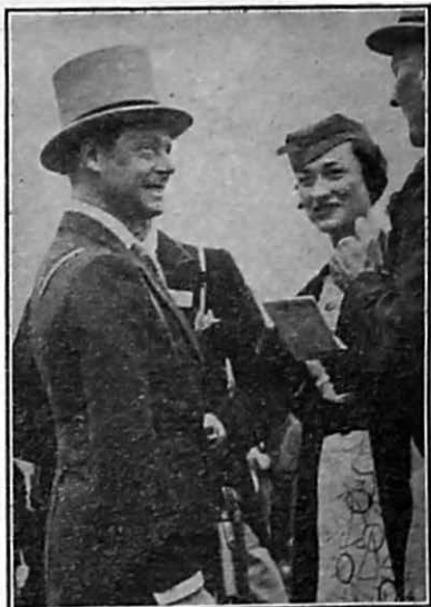
KING EDWARD, MRS. SIMPSON*

"The Malta marriage was ignored. The Admiral's daughter and her two children were banished to some remote fastness in the wilds of Scotland, sometimes described as a lunatic asylum, where after a time the unhappy lady died." Some versions said her father committed suicide by sinking his warship with all hands.