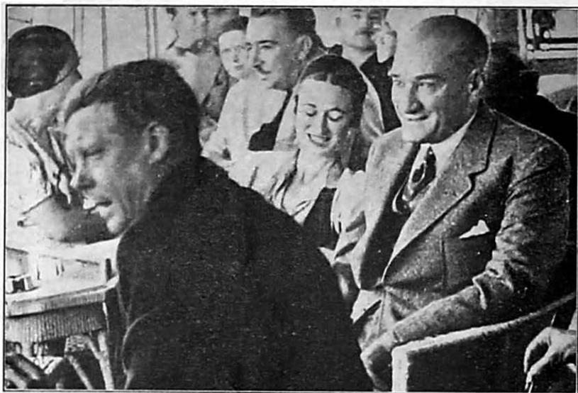
KING EDWARD, MRS. SIMPSON, DICTATOR KEMAL ATATURK* The Dictator received her like a Queen.