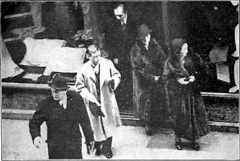
KING EDWARD, MRS. SIMPSON (extreme right)* . . . Coming out of a lingerie shop.