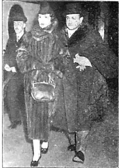
THELMA LADY FURNESS*