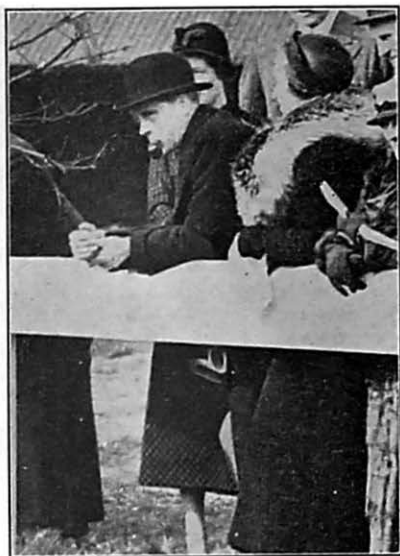
KING EDWARD, MRS. SIMPSON* Intimate friends knew, then.

Mrs. Simpson talked in a low, vibrant voice with a broad American accent. Some of that accent crept occasionally into the Prince's speech.* That year