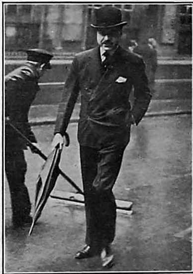
ERNEST ALDRICH SIMPSON Husband No. 2 stayed at home.