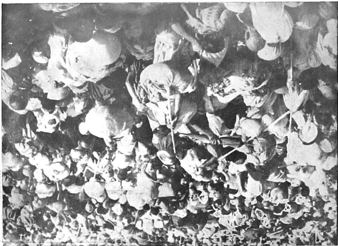
PLATE No. 1