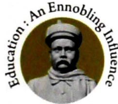
Gopal Krishna Gokhale