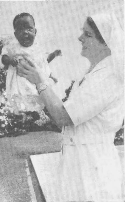
A Sister in the Colonial Nursing Service

nurse, and in addition to her nursing training she has to undergo special training in a missionary training college for the religious side of her work before she is sent abroad. As her duties as a nurse are very varied it is desirable for her to be not only a State Registered Nurse but also a certified midwife. On arrival in her mission abroad she has to cope with all sorts of difficulties amongst a strange people and in a strange language. She may be called upon to train nurses of another race whose education and background are quite different from her own. Or she may find herself in some isolated place where there is no resident doctor, and she has to decide when to deal with the patient herself,