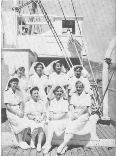
Nursing Sisters of the Navy

duties of a preventive and educational character and must know the dangers of the various industrial processes carried out in her factory. She must be able to educate the workers in personal hygiene as applied to the prevention of industrial maladies, and in the smaller factories she may also be asked to undertake duties in connection with the general welfare of the workers. Although special training is not insisted upon, many nurses do take the special courses arranged at the Royal College of Nursing or at the Birmingham Accident and Rehabilitation Centre. These last from three to twelve months.