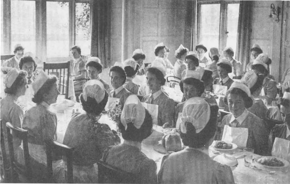
A Nurses' Dining Room

nursing procedure. This examination is in two parts which may be taken together or separately. Some student nurses take the first part before entering hospital (see para. 4) and others can take it at the end of six months' training in their training hospital.