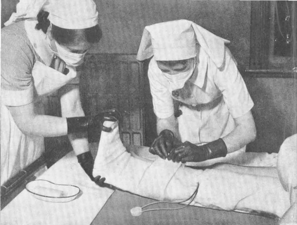
The Nurse helps Sister to do a Special Dressing

are likely to operate in all hospitals and nursing services in this country. By adding the cash value of emoluments received by resident nurses to the cash salary received, it will be appreciated that the nursing profession nowadays offers not only wide scope and prospects of promotion, but also remuneration as high as that in many of the other openings for women. The salaries and allowances recommended by the Rushcliffe and Taylor Committees which are quoted in this pamphlet were formed with due regard to the conditions existing at the time the Committees made their reports, and it would be open to the Committees to submit to the Ministry concerned proposals for revision should circumstances warrant such a course.