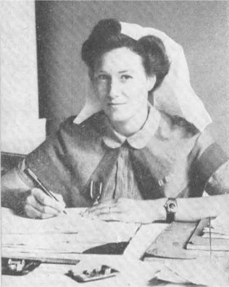
Army Nursing Sister

ambulance trains and hospital ships—and like any other member of H.M. Forces in time of war they may find themselves in comparative safety, e.g. , in a reception station at home, or in great danger, e.g. , in taking wounded on a hospital ship under the enemy's fire. In peace time there are fewer foreign stations for nurses. A proportion of the work is in nursing the wives and families of serving men.