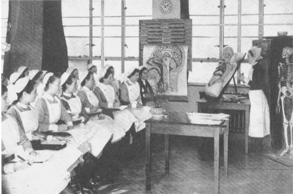
The Lecture Room

Councils has been covered. The theoretical training in the lecture rooms and the practical training in the wards run side by side, but in many hospitals the first three months are spent away from the wards in a preliminary training school.