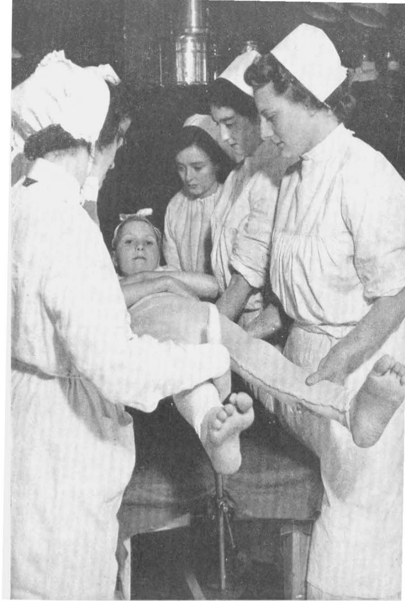
Orthopædic Nursing—Plastic Technique

Wales and for Scotland, so that in their two years at a sanatorium they will also obtain a double qualification. Thereafter they would be eligible to perform any nursing