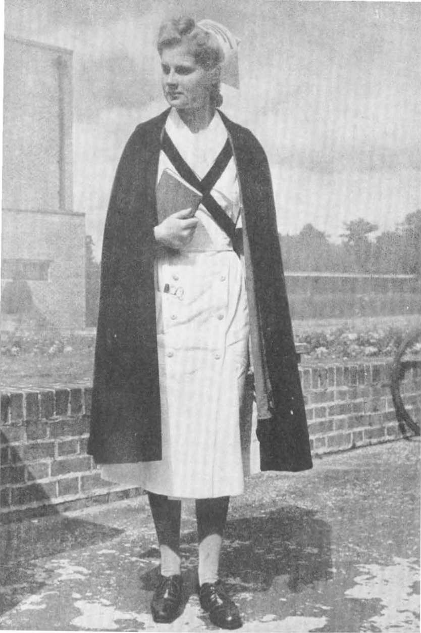
A Sanatorium Nurse

At the present time nurses qualifying in this way are eligible to have their names included on the Assistant Nurses Roll kept by the General Nursing Councils for England and