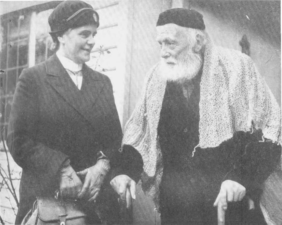
The District Nurse