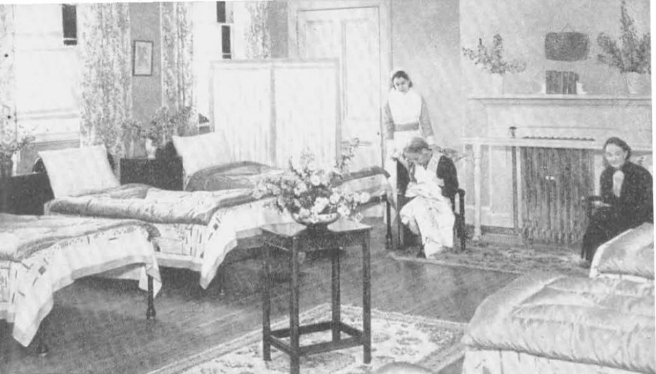
Mental Nursing—Pleasant, sunny rooms help to speed recovery