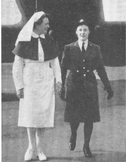
R.A.F. Nursing Service

51. A missionary nurse is not merely a nurse in a mission hospital. She is a missionary who is also a