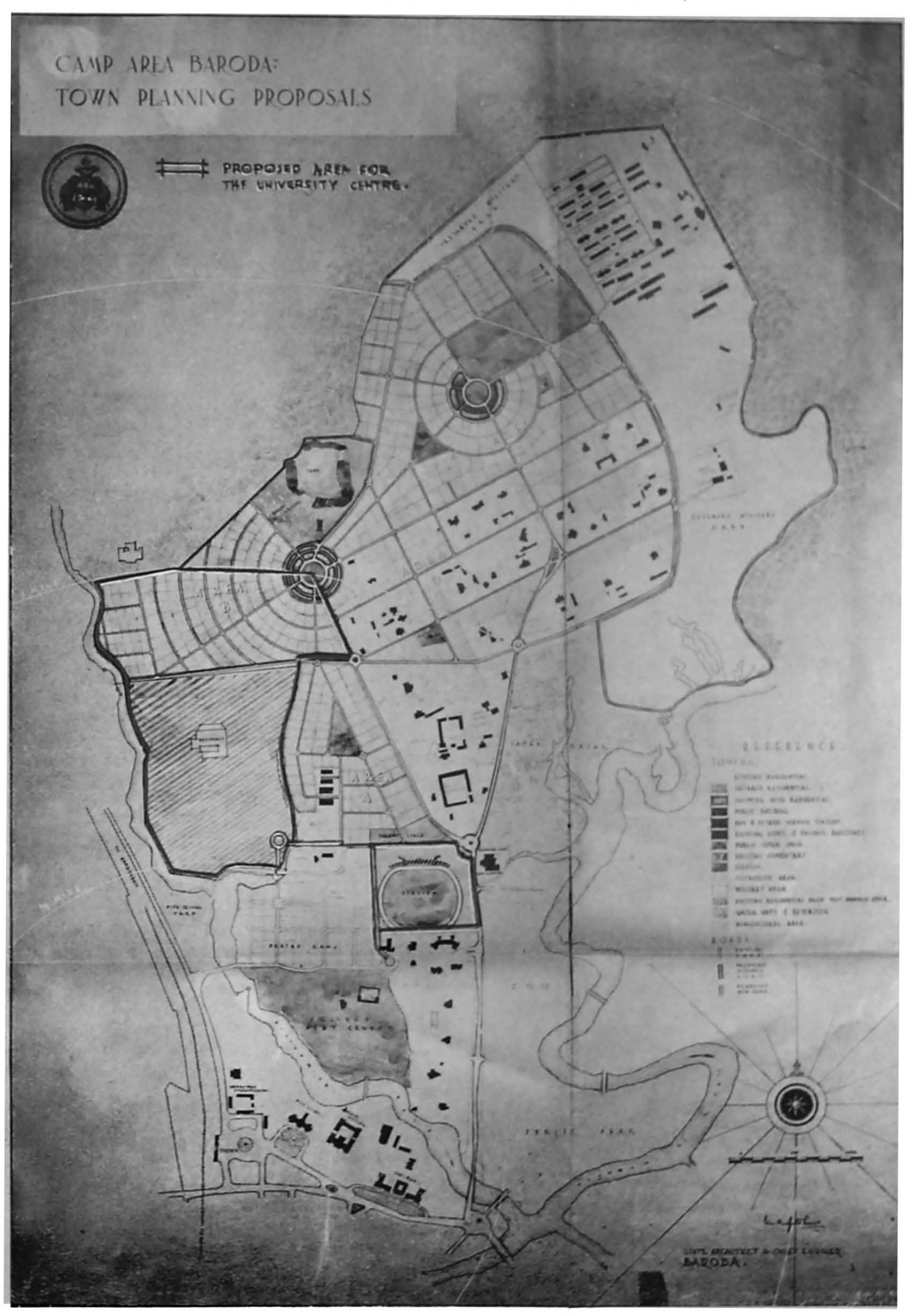
A map showing the proposed site of the Baroda University