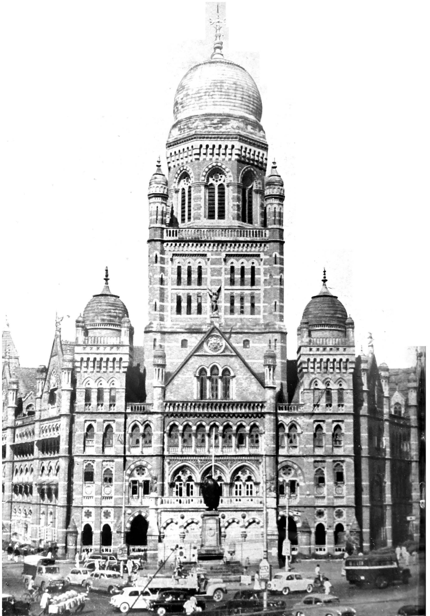
MUNICIPAL HEAD OFFICES