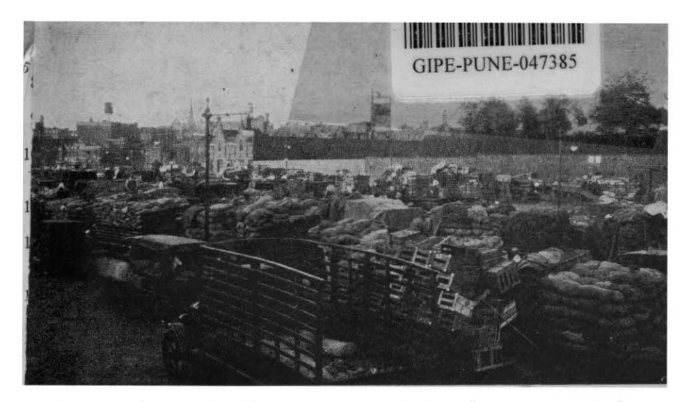
PRODUCE ARRIVING IN WALLABOUT FARMERS' MARKET, NEW YORK CITY-