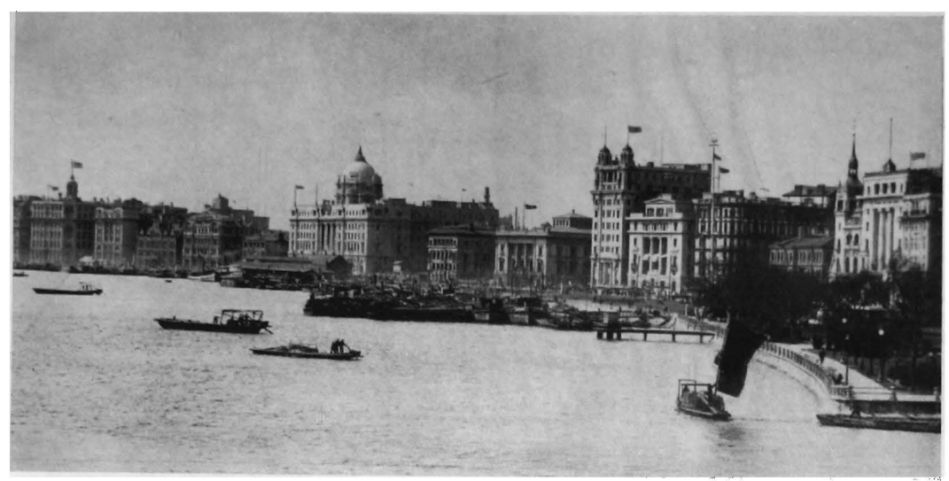
By permission of