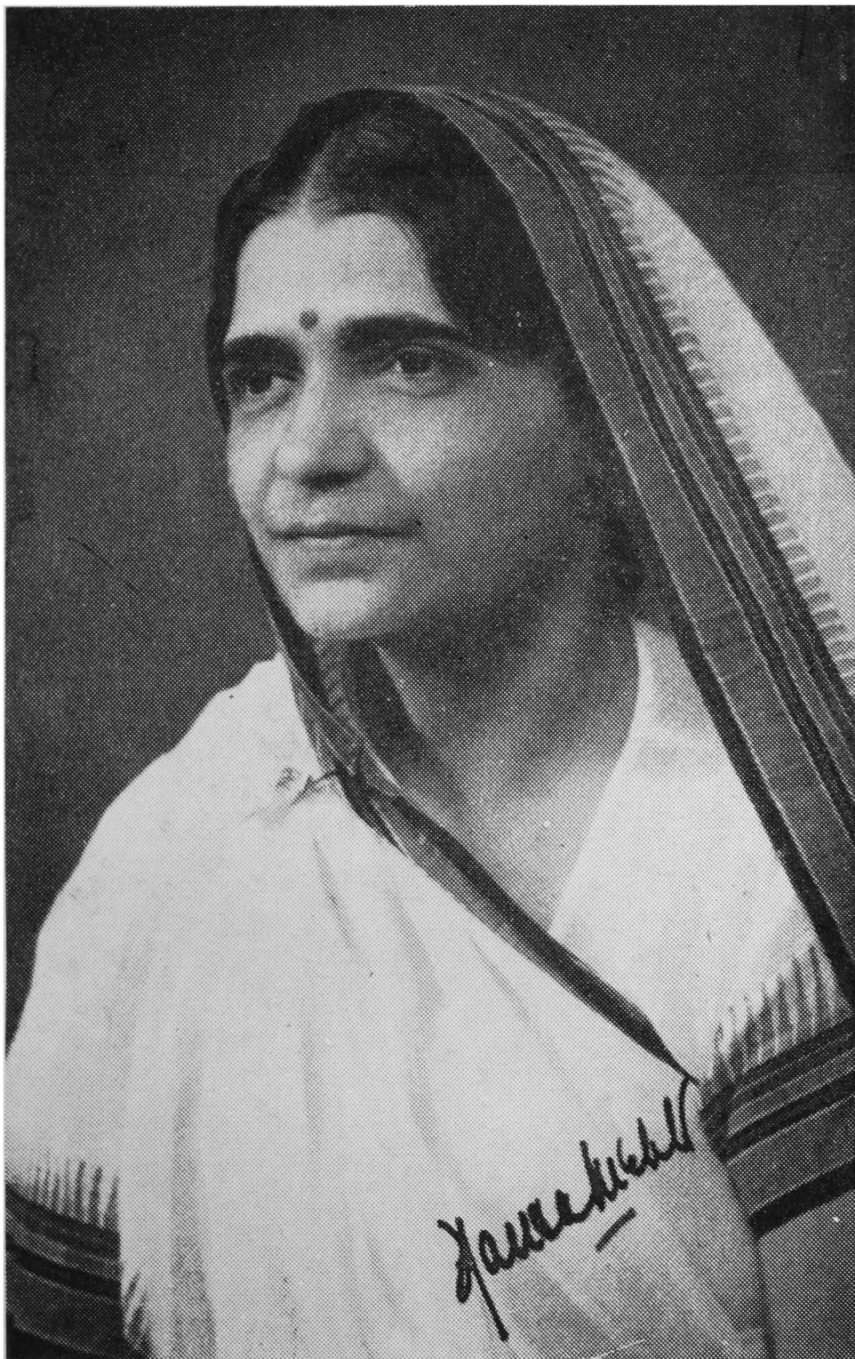
Shrimati Hansa Mehta, President, All-India Women's Conference, Hyderabad (Sind) 1945.