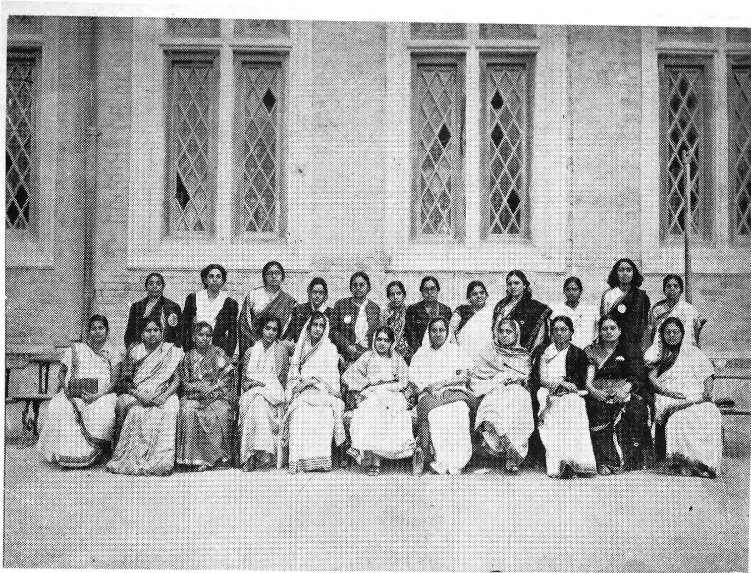
Members of the Standing Committee of the A.-I. W. C., 1944-1945.