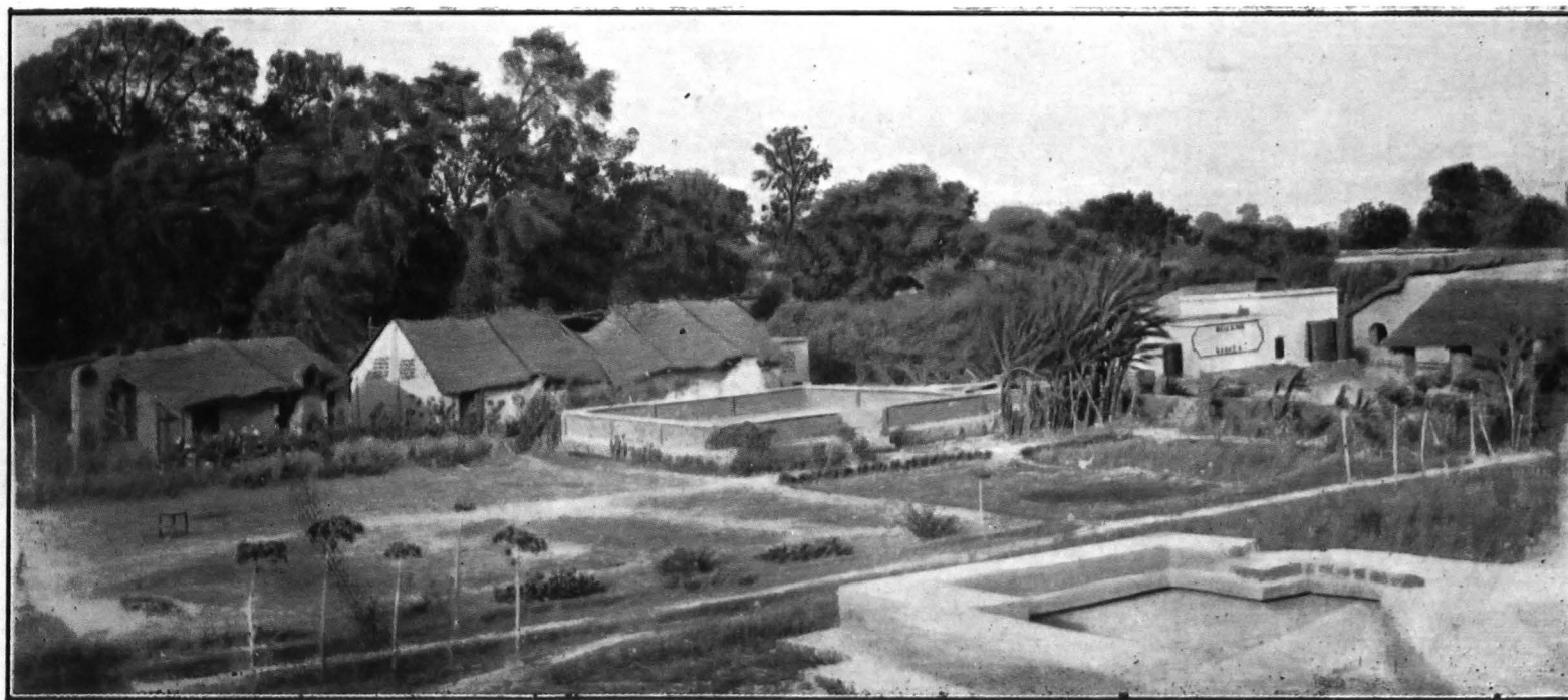
General view of the Nagalia Farm buildings, Bilari, where the experiments were conducted.