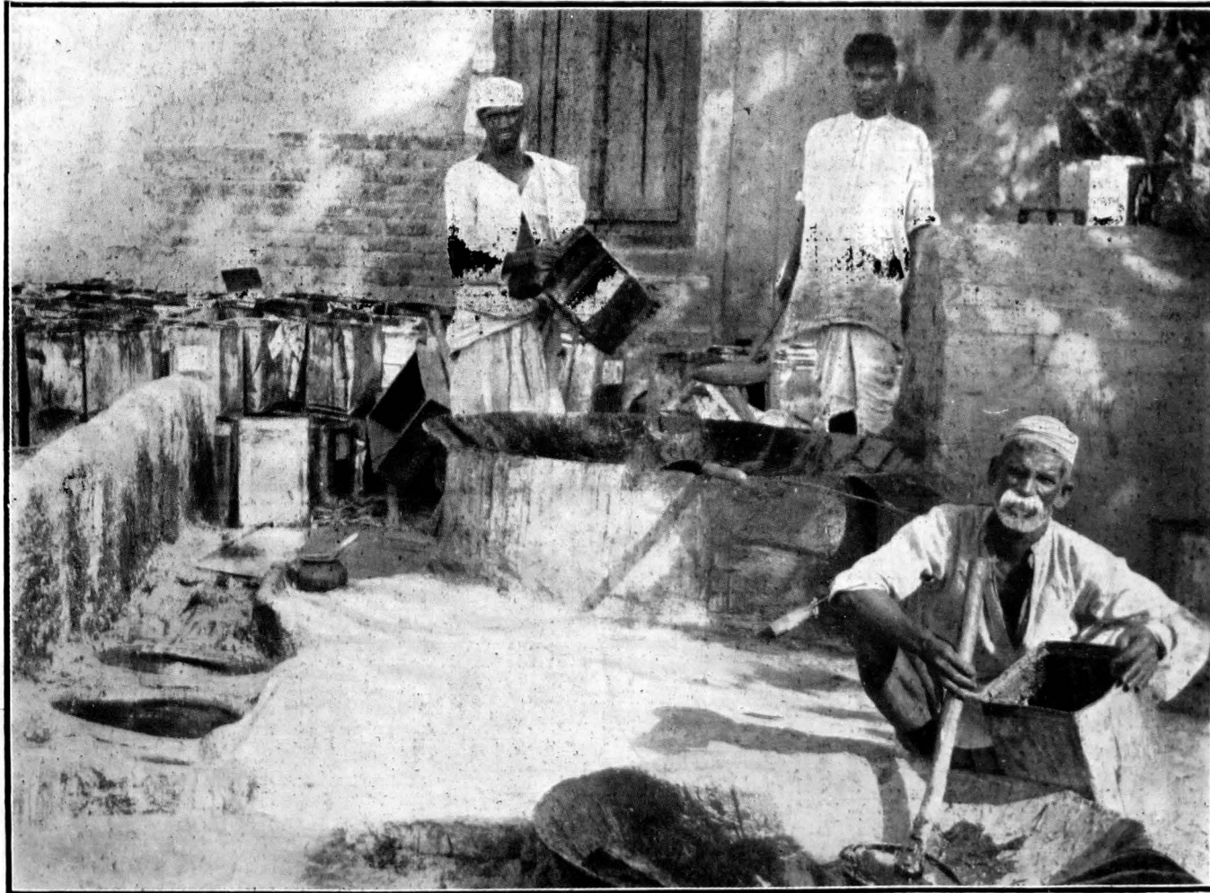
The Rohilkhand Bel for molasses boiling.