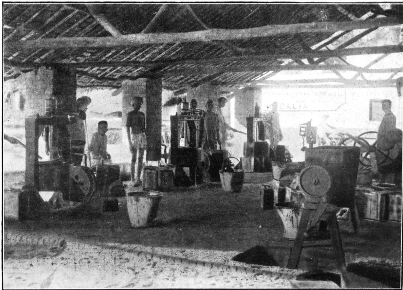
General View of Centrifugal machines and Pugmills.