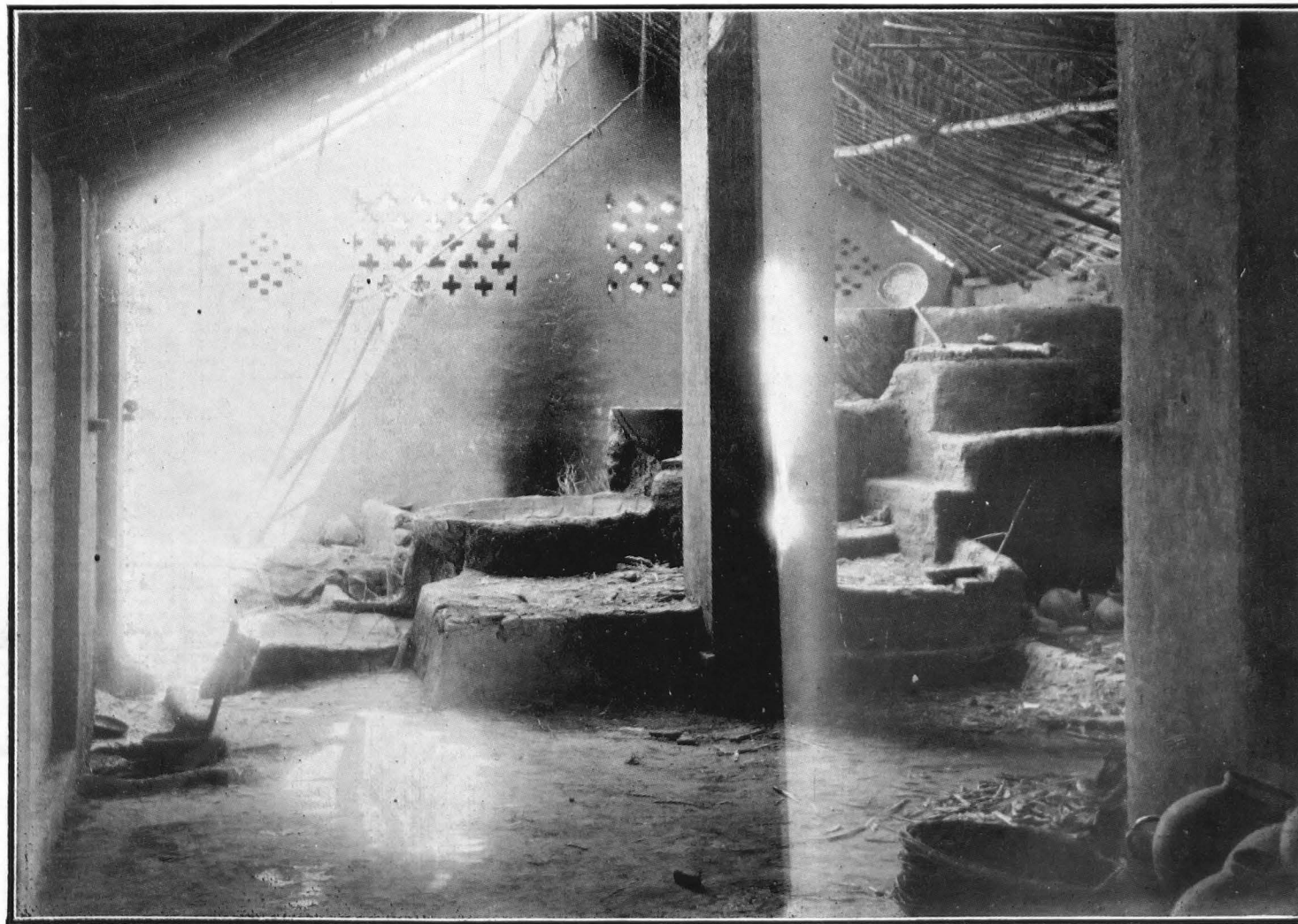
The Rohilkhand Bel for juice boiling.