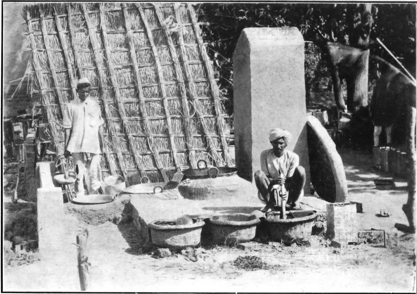
The Bhopal Bel for molasses boiling.