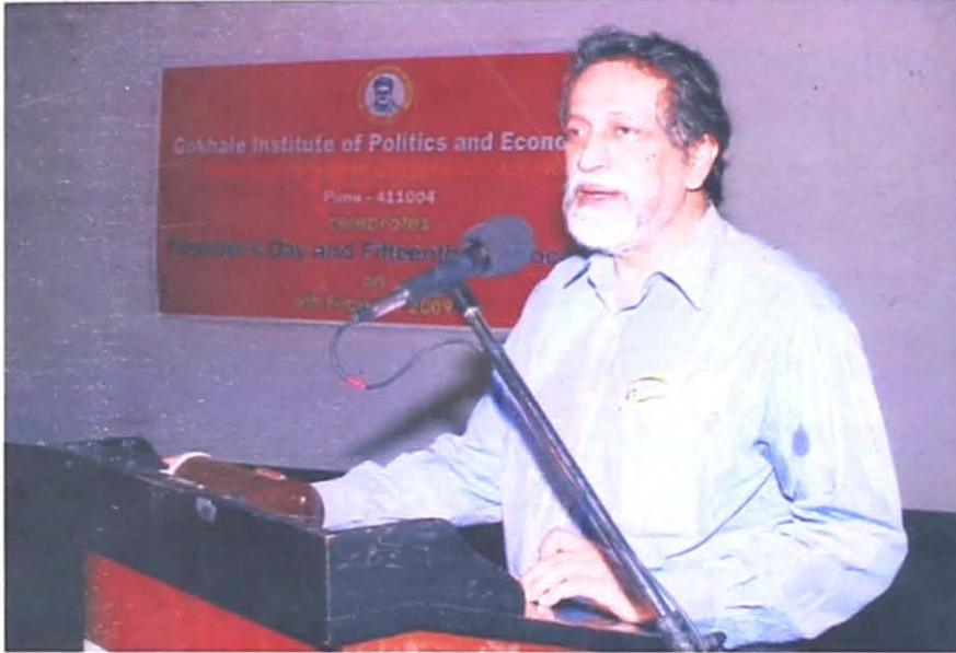
Prof. Prabhat Patnaik, Chief Guest, delivering the Convocation Address