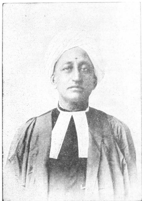
Dr. Sir S. Subramania Aiyar.