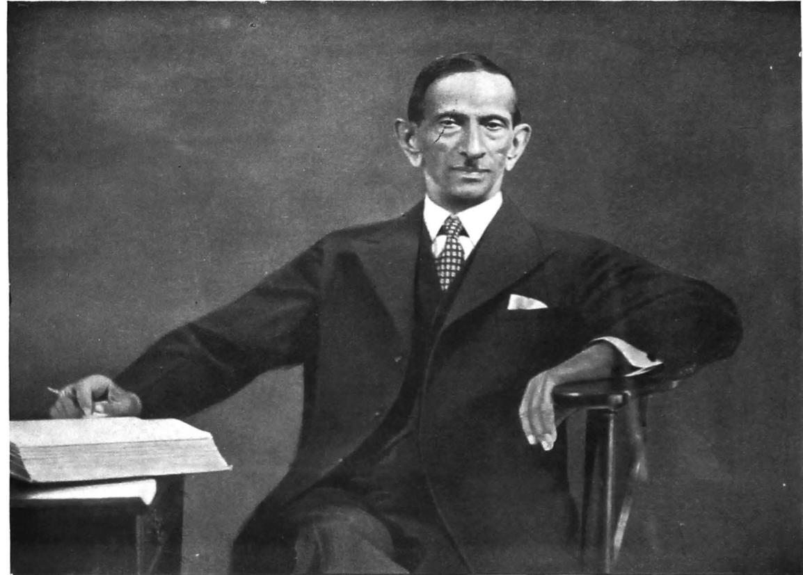
SIR CHIMANLAL SETALVAD, K.C.I.E., LL.D. President.

Nineteenth Session of the National Liberal Federation, Calcutta, December 29th, 30th and 31st, 1937.