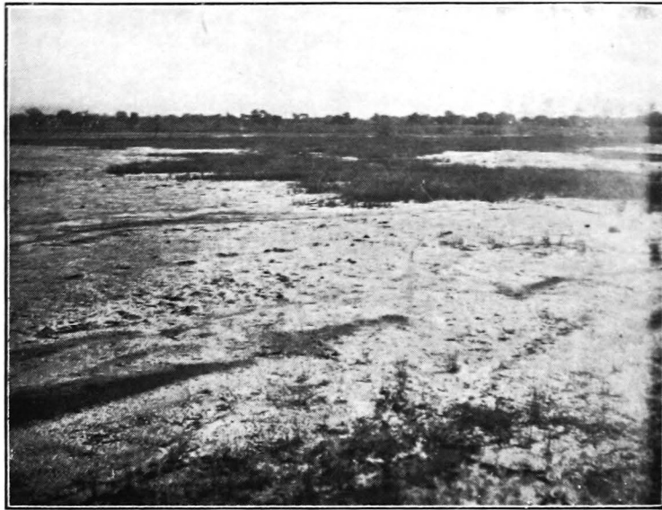
3. Photograph looking across salt land towards Malad from Plot No. 24.