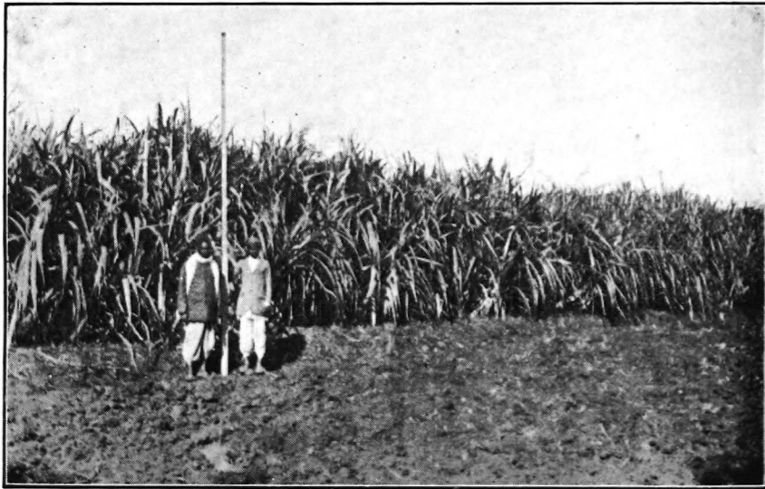
4. EXPERIMENTAL SALT AREA—BARAMATI.—Cane grown by Mr. Shembekar in reclamation plots (1921-22) : outturn 55 pallas of gul.