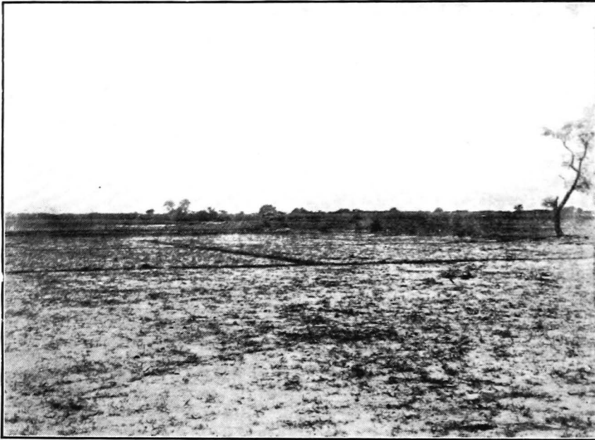
7. S. No. 123 looking W.