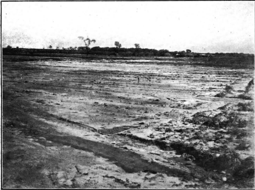
6. S. No. 126 looking N.E.