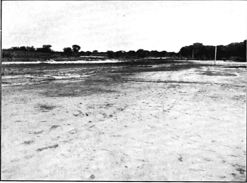
5. S. No. 42 above Nira-Baramati road looking N.E.