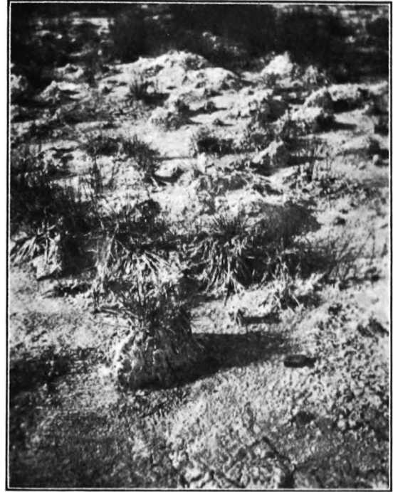
2. Photo showing salt encrustation in Plot No. 24 of Baramati salt lands. Note match box.