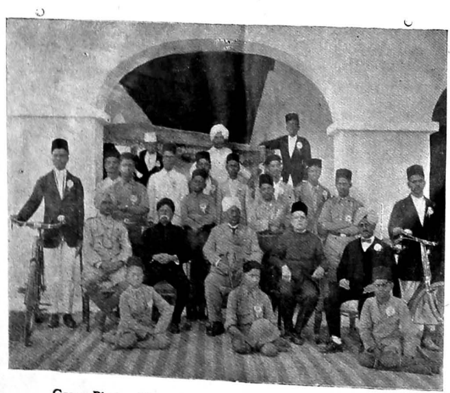
Group Photo of President, Office-Bearers and Volunteers.