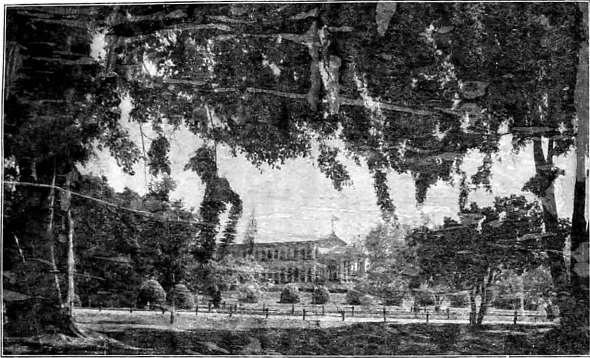
PUBLIC OFFICES, CUBBON PARK, BANGALORE