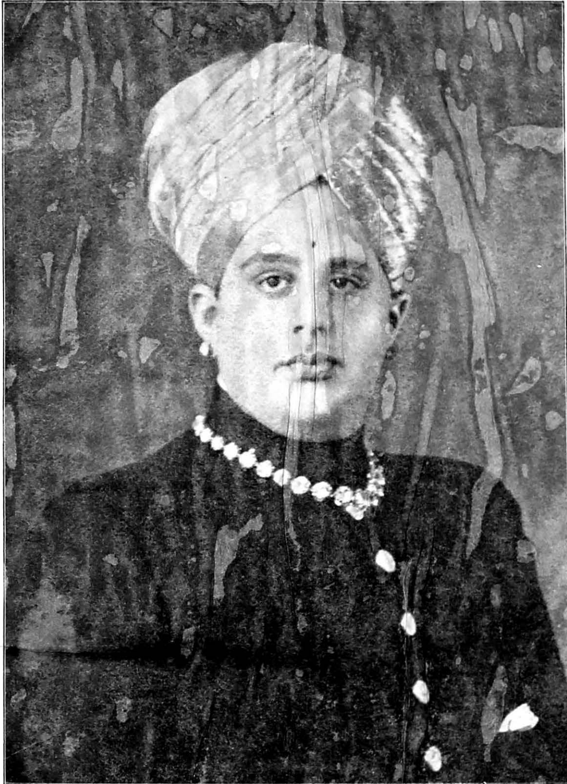
HIS HIGHNESS SRI JAYACHAMARAJA WADIYAR BAHADUR, MAHARAJA OF MYSORE