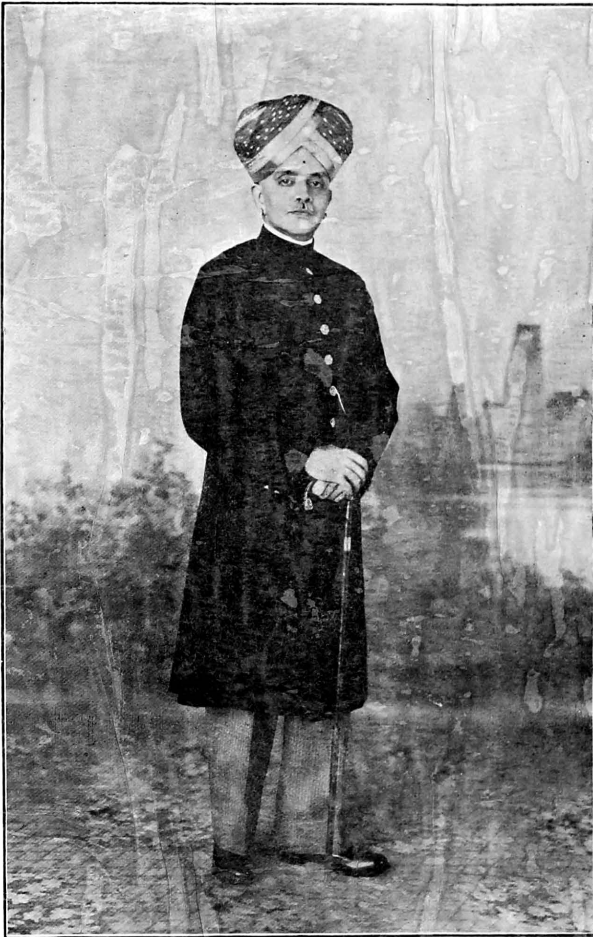
HIS HIGHNESS SRI KRISHNARAJA WADIYAR BAHADUR, G.C.S.I., G.B.E., MAHARAJA OF MYSORE (1902-1940)