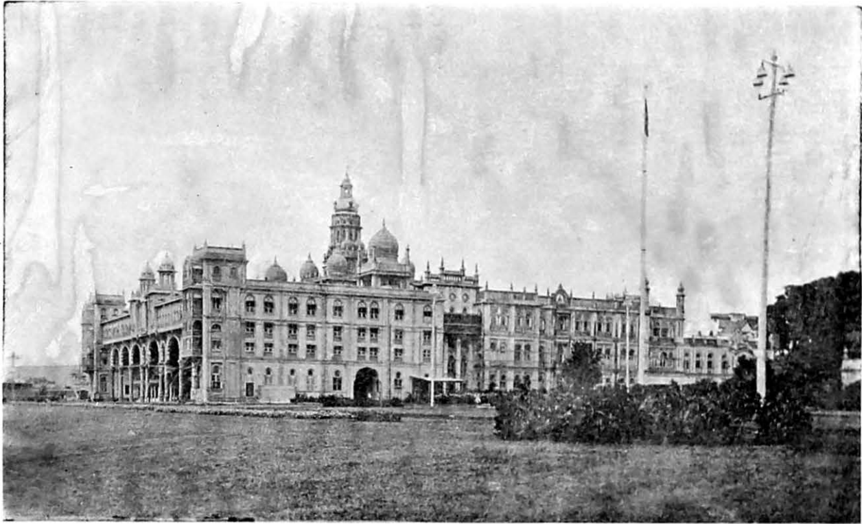
THE PALACE, MYSORE