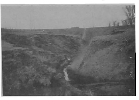
Fig. 2. This large, raw gully in Monroe County was widening at the expense of adjacent fields.

Submarginal Land. The United States Department of Agriculture defines submarginal land as "land so poorly adapted to farming, or so seriously deteriorated that nothing is in store for the inhabitants but extreme poverty and wretchedness." In Iowa extended areas of sub-