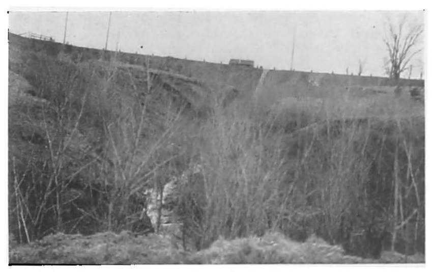
Fig. 3. The same gully as shown in fig. 2, 4 years later. Willows are in the moist bottom, locust occupy the steep dry slopes, and pines have been planted back from the lip of the gully.

Cold, Moist Storage. Some seeds must be kept in cold, moisture storage over winter. The following method is sometimes called stratification. Moist sand is placed in a box to a depth of 1 inch and covered with a layer of seed 1 inch thick, and another 1 inch layer of sand followed by another