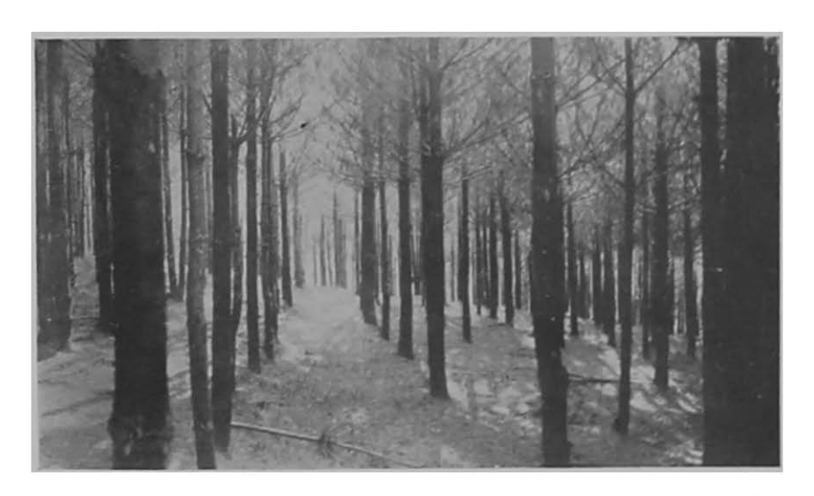
Fig. 5. White Pine planted on steep land to stop excessive sheet crosion. These trees are 13 years old. Tama County.

Natural Seeding and Sprouting. Natural regeneration of trees can be accomplished wherever mature, seed-producing trees stand on or adjacent to the area, and by sprouts from stumps of recently cut trees. In either case, natural regeneration from seed-trees or from stumps, the area must be fully protected from livestock to prevent the young trees from death or injury by browsing or trampling.