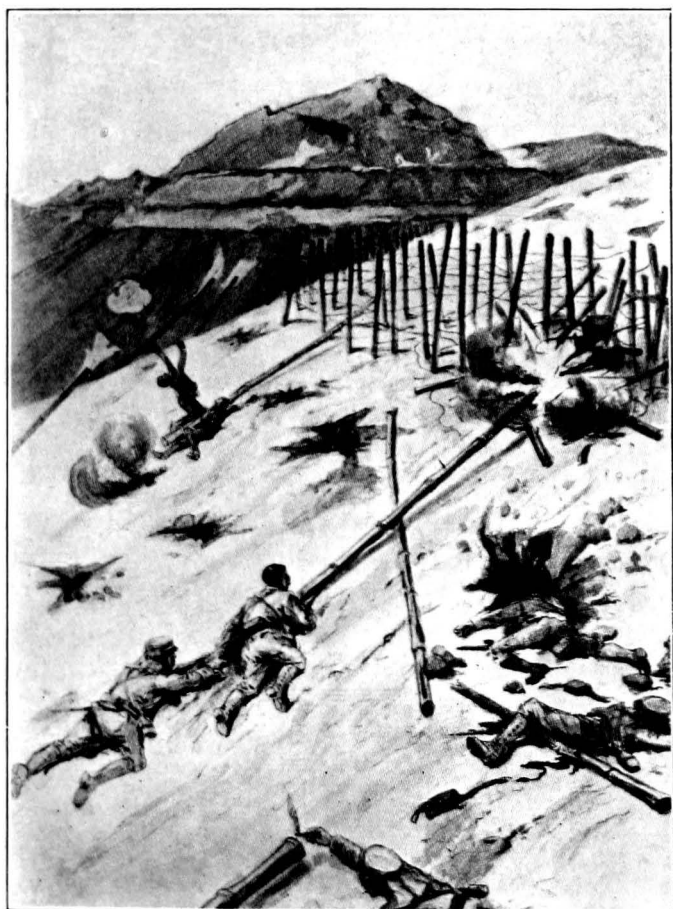
SCENE IN THE LATE RUSSIAN-JAPANESE WAR