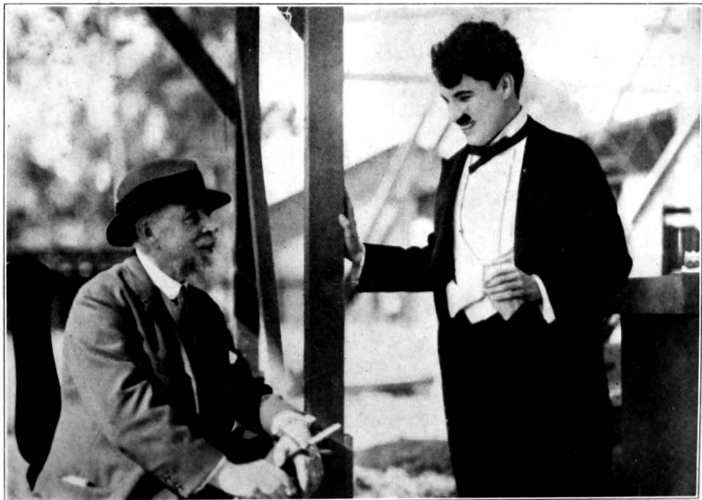
THE AUTHOR VISITS CHARLIE CHAPLIN IN CALIFORNIA