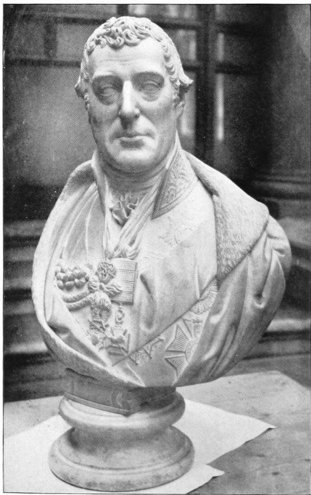
THE DUKE OF WELLINGTON.