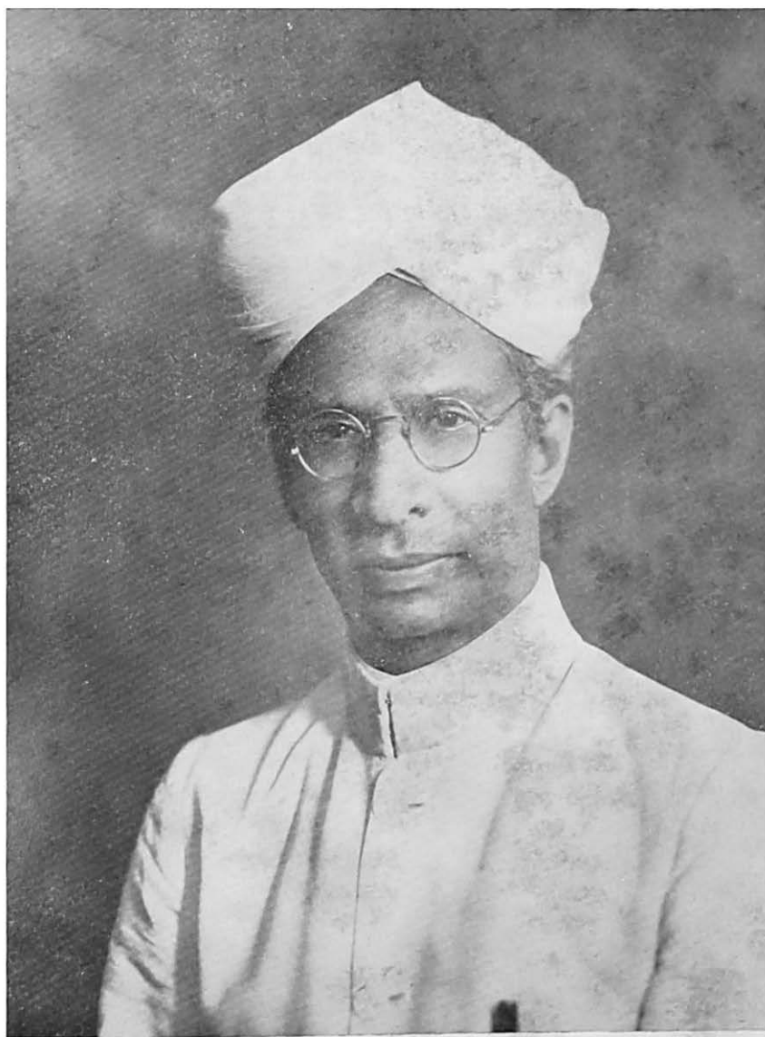
PROFESSOR S. RADHAKRISHNAN