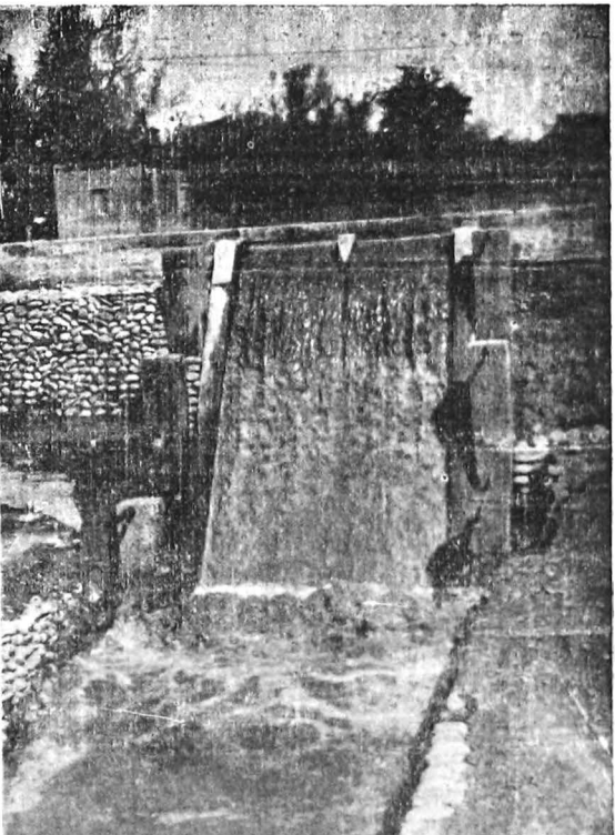
Experiments in progress to evolve the best design for the destruction of energy of waters that will fall over the Bhakra Dam The picture on the left shows "The Shooting Bucket" and that on the right "The Deep Bucket". The model represents a discharge of 115,000 cusecs on the original