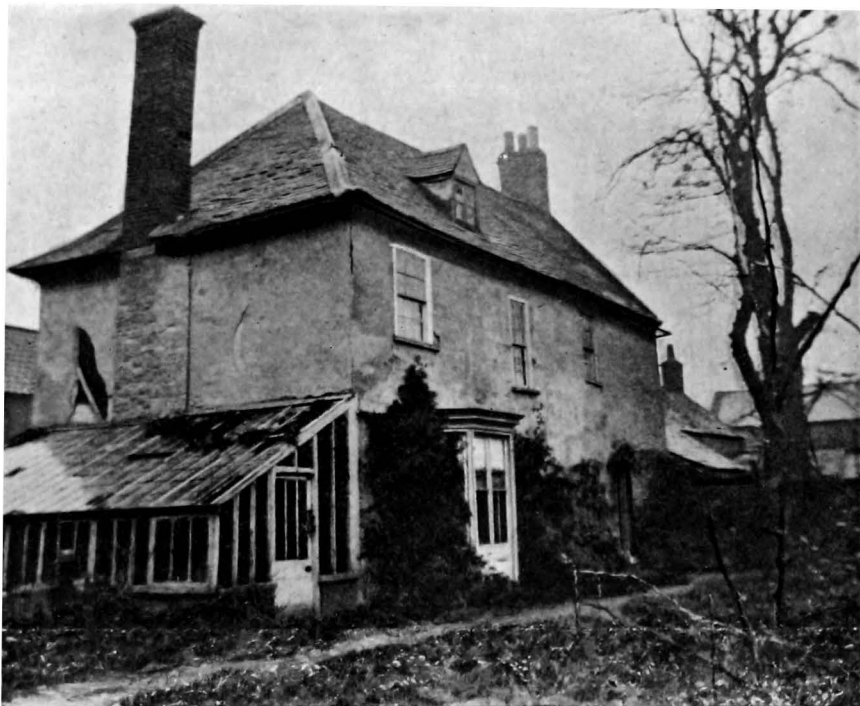
SIR HARRY SMITH'S BIRTHPLACE, WHITTLESEY.

(The "Black Door" is seen to the right.)