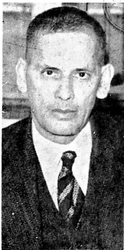
SIR SHAFAT AHMAD KHAN,

High Commissioner for India in the Union of South Africa.