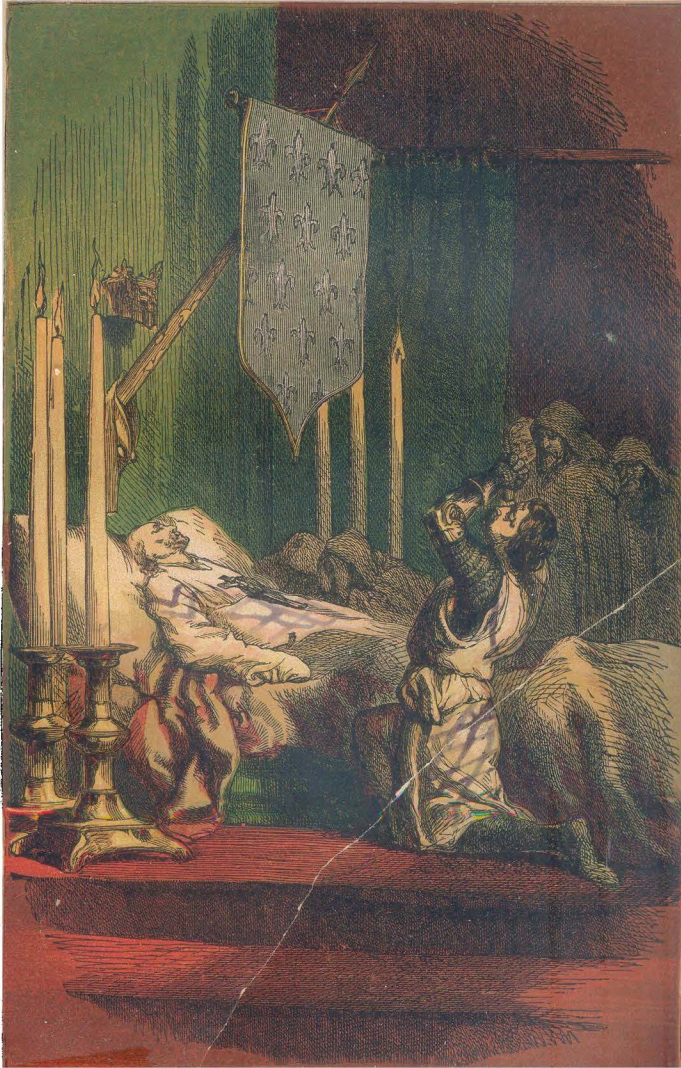
DEATH OF LOUIS THE NINTH OF FRANCE.