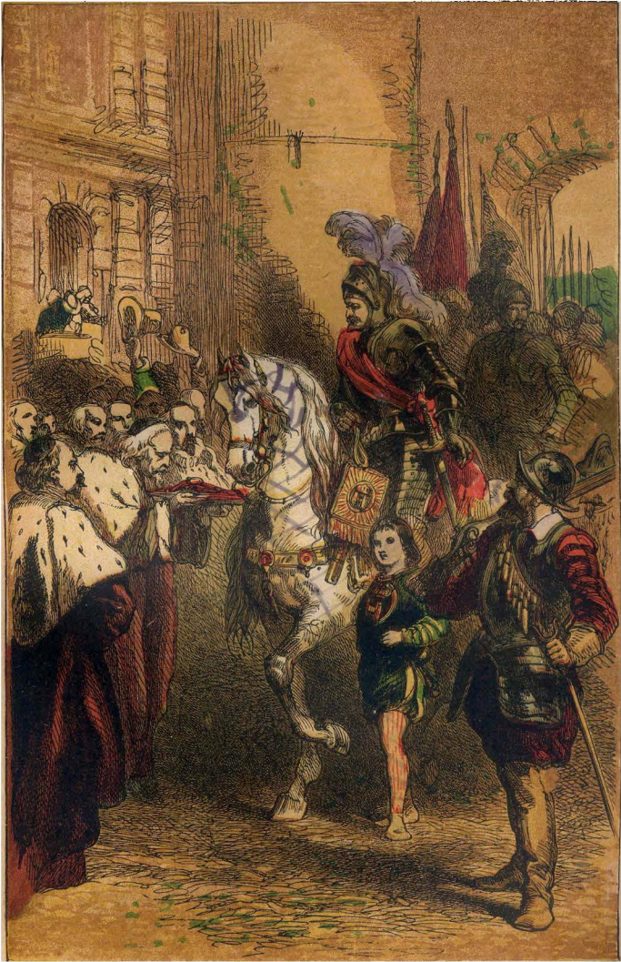
HENRY THE FOURTH ENTERS HIS CAPITAL.