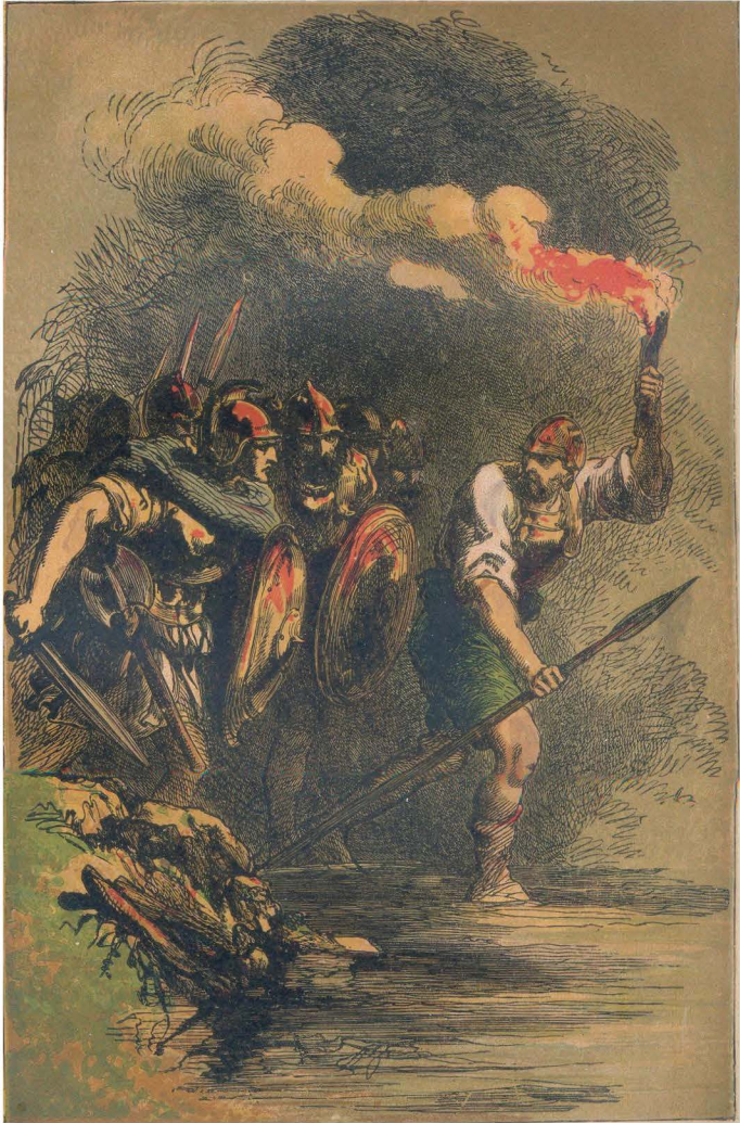
SIEGE OF VEIL.