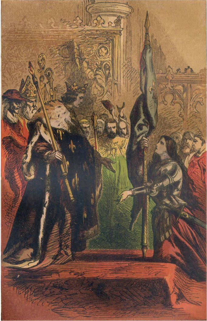
JOAN OF ARC ADDRESSING THE KING.