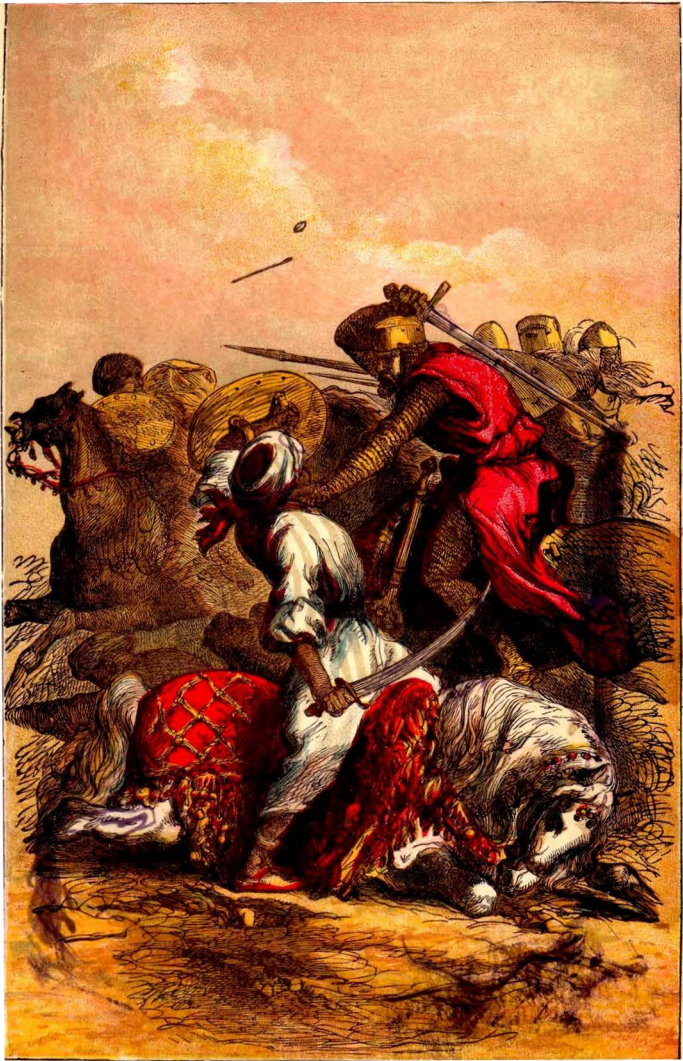
PROWESS OF THE CRUSADERS BEFORE ANTIOCH.