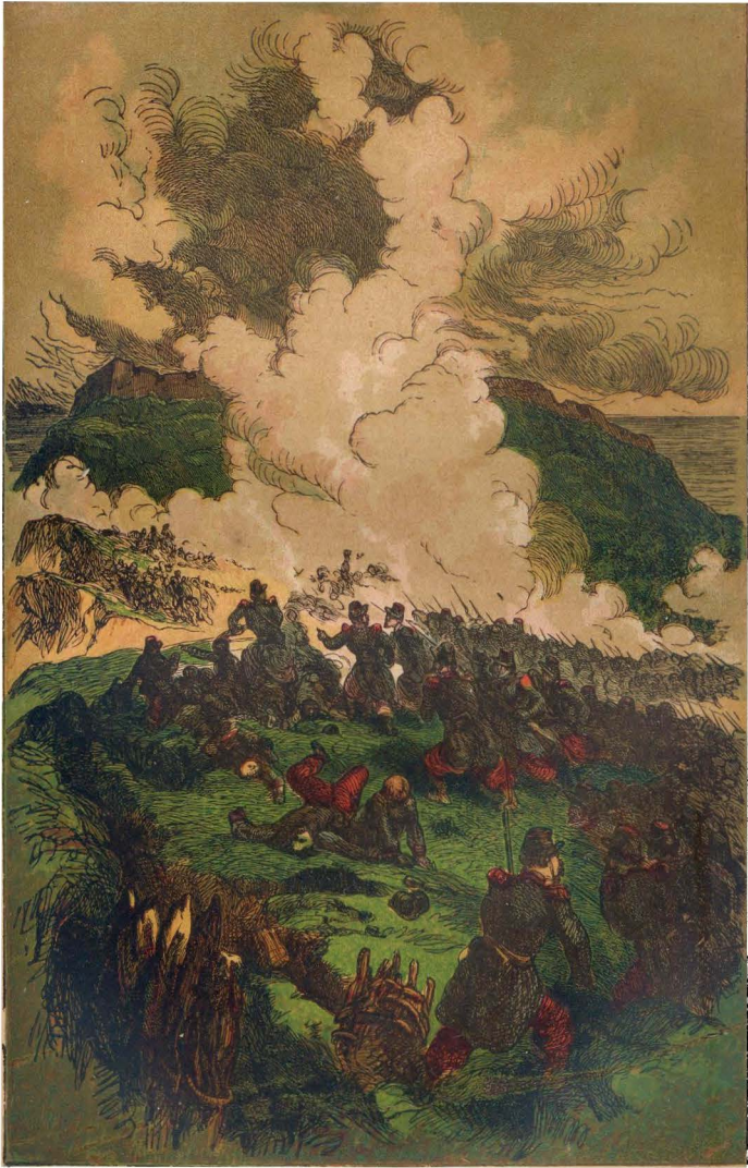
ASSAULT ON THE MALAKOFF