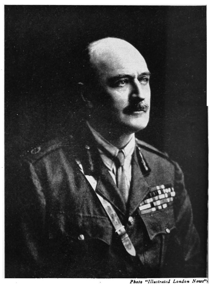
FIELD-MARSHAL VISCOUNT ALLENBY OF MEGIDDO AND FELIXSTOWE, IN 1922