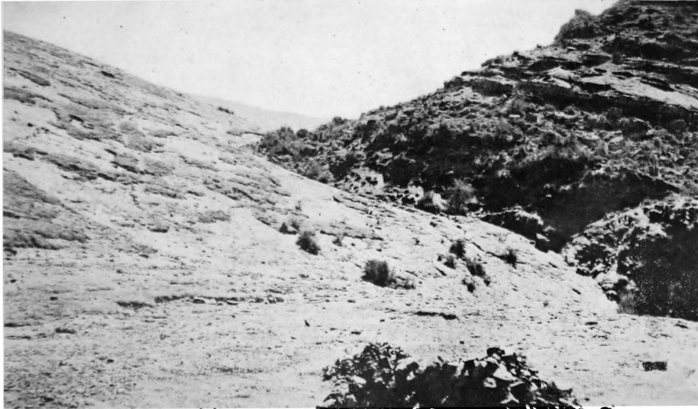
BAUXITE CHAKAR G AREA