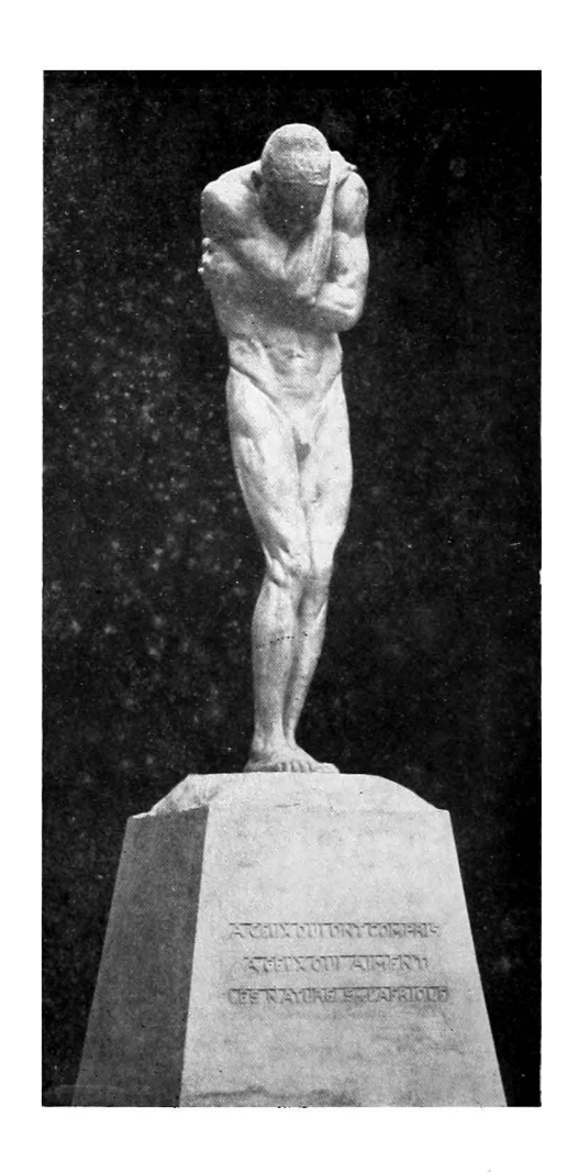
"TO THOSE WHO HAVE UNDERSTOOD: TO THOSE WHO LOVE THE NATIVES OF AFRICA." (From the statue by the late Herbert Ward, the African explorer)