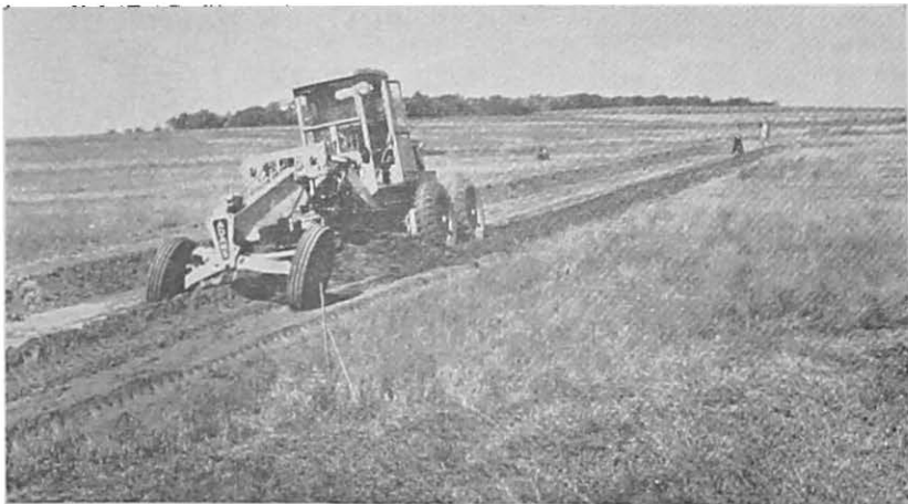
Motor graders are effective in building terraces.

Practically all counties of Wisconsin in which terracing is being done are Soil Conservation Districts. Technicians of the Federal Soil Conservation Service who are servicing these districts have training and experience in laying out and building terraces. They will be glad to help farmers with terracing and other soil conservation practices.