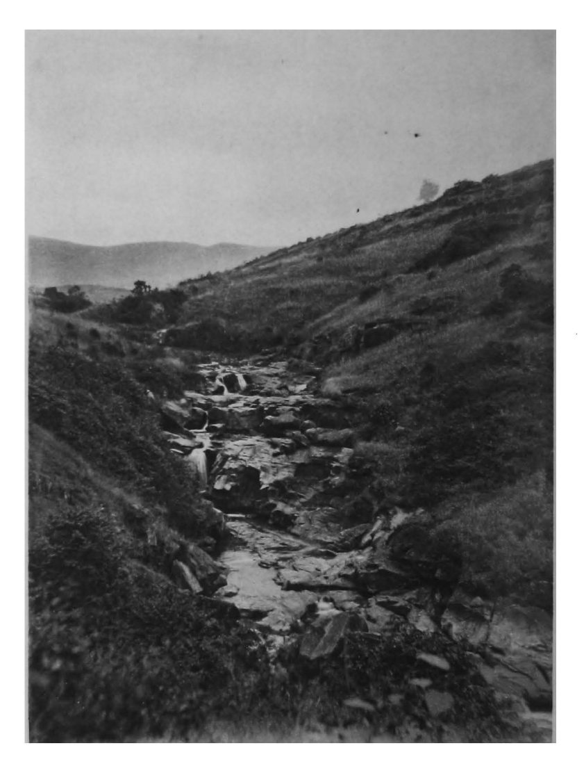
A STREAM IN ULU.