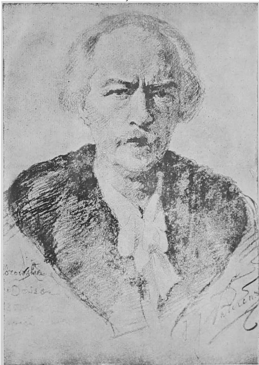
Ignacy Paderewski, the famous Polish pianist.