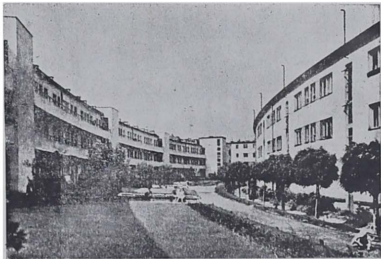
Workmen co-operative quarters in Warsaw.