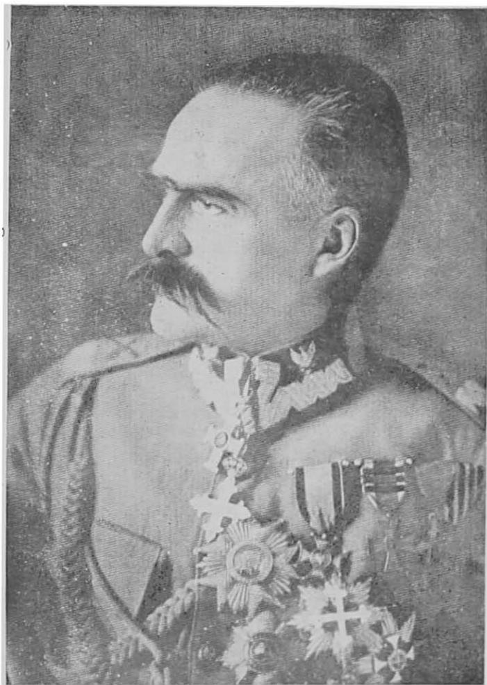
Marshal Jozef Pilsudski, creator and builder of modern Poland.