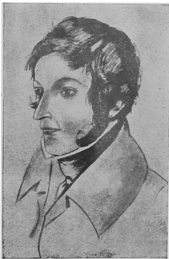
Adam Mickiewicz, the greatest poet of Poland.