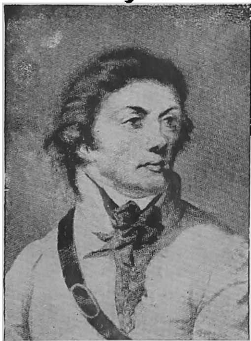
Tadeus Kosciuszko, hero of the fight for independence in 1794.