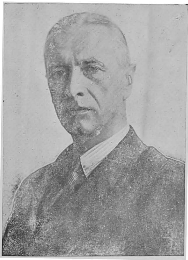
Władysław Raczkiewicz, President of the Republic of Poland.