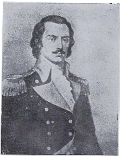
Kazimierz Pulaski, hero of Polish and American wars for independence.