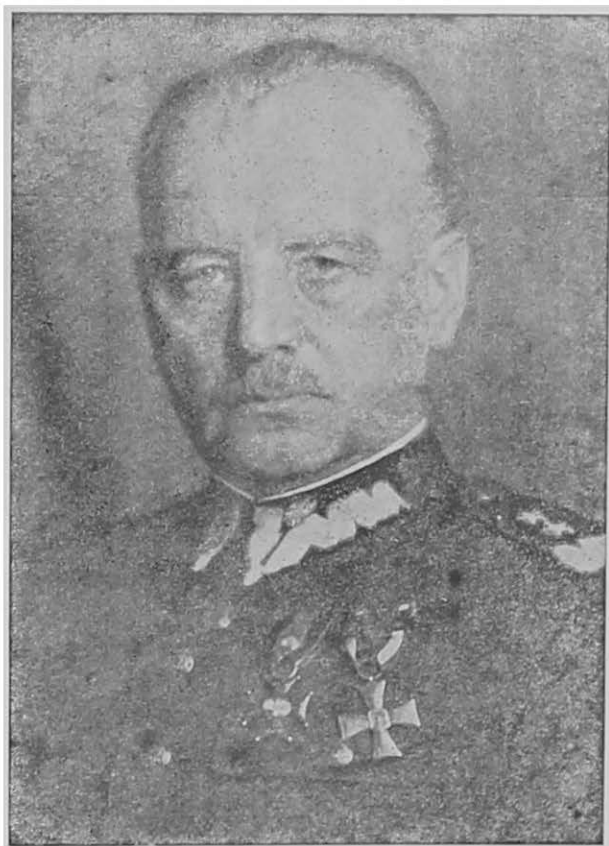
General Wladyslaw Sikorski, organiser and C. in C. of the Polish Army in France in 1939 and in Britain in 1940. Killed in 1943.