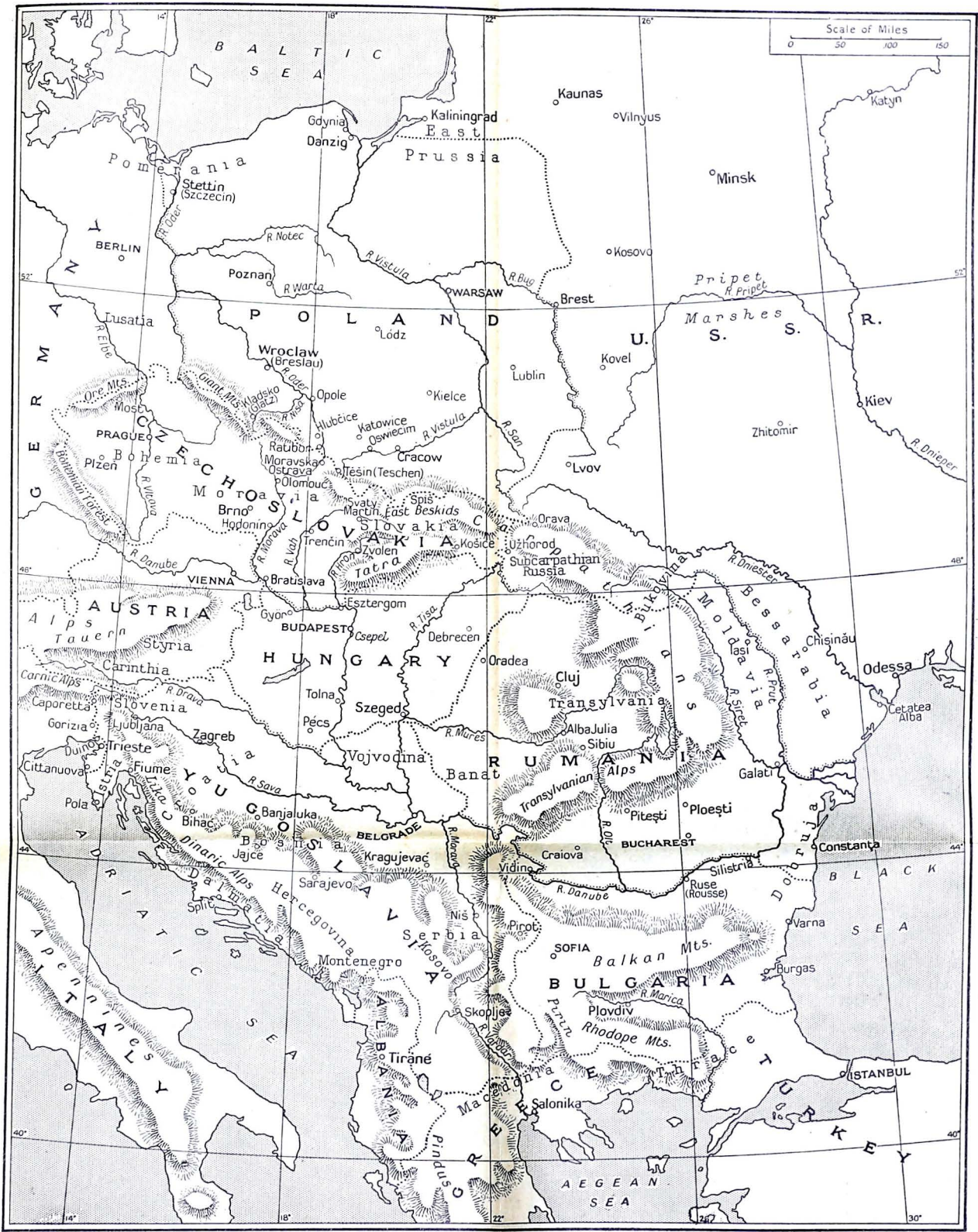
CENTRAL AND SOUTH EAST EUROPE