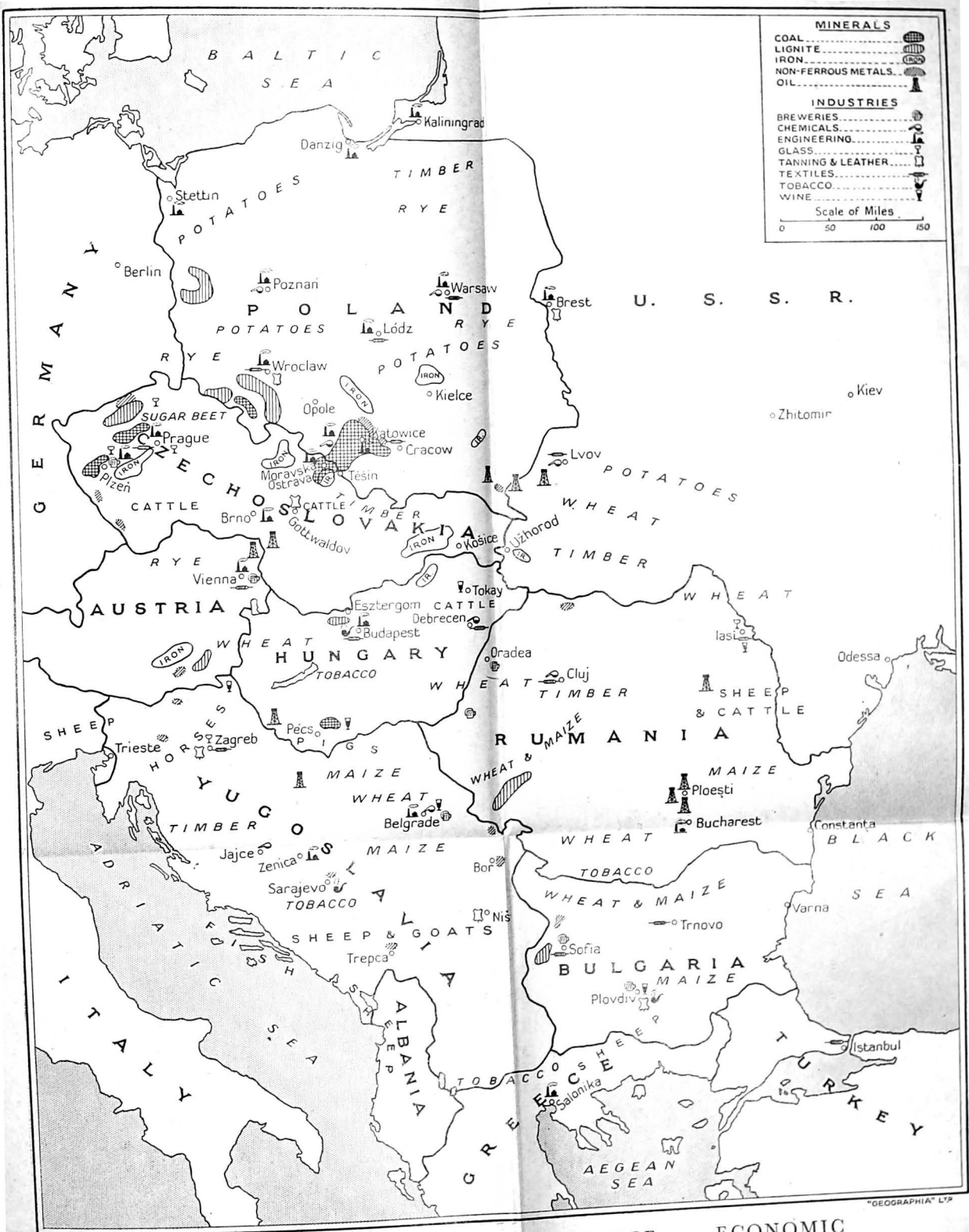
CENTRAL AND SOUTH EAST EUROPE — ECONOMIC