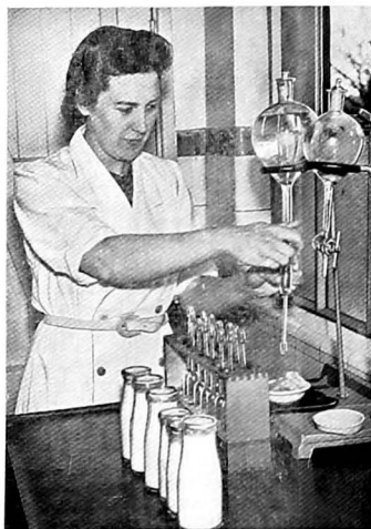
Testing for Butter-fat Content.

The Ministry's trade experts have to know how much milk must go out each day to any given area so that—in spite of fluctuations in supply and demand—all is used and all absolutely fresh. They have at their command, in every part of the country, special milk lorries, milk trains and glass-lined or stainless steel tanker vehicles.