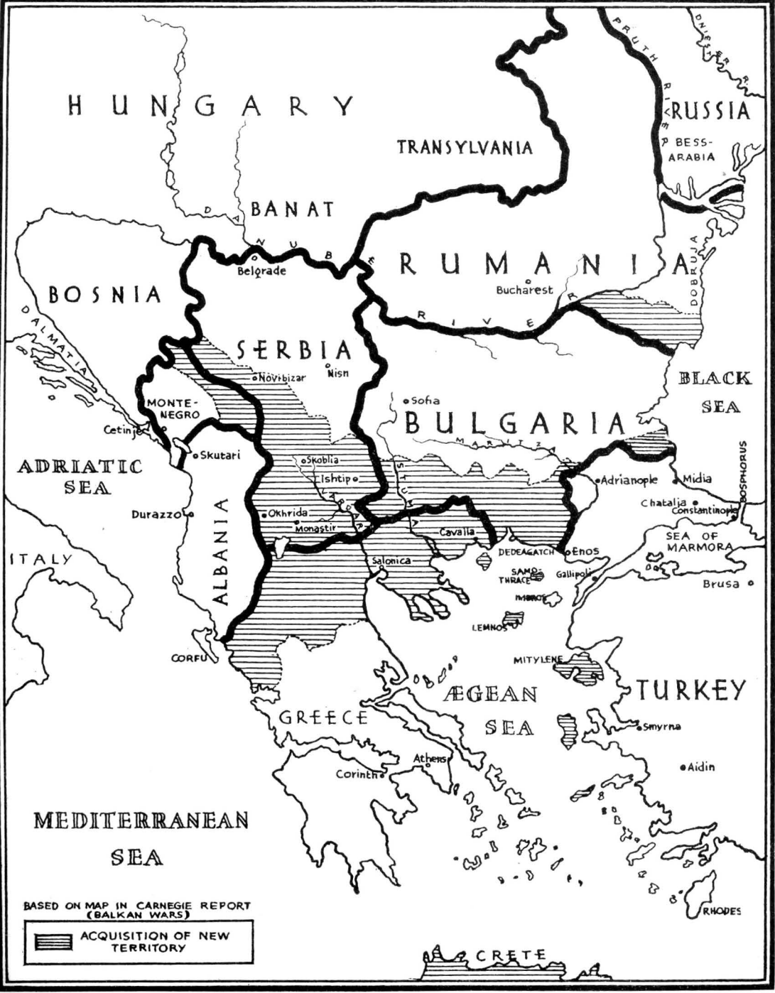
BASED ON MAP IN CARNEGIE REPORT (BALKAN WARS)