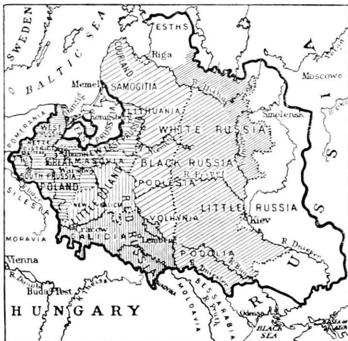
Boundary of Poland at the Union of Lublin, 1569 —————