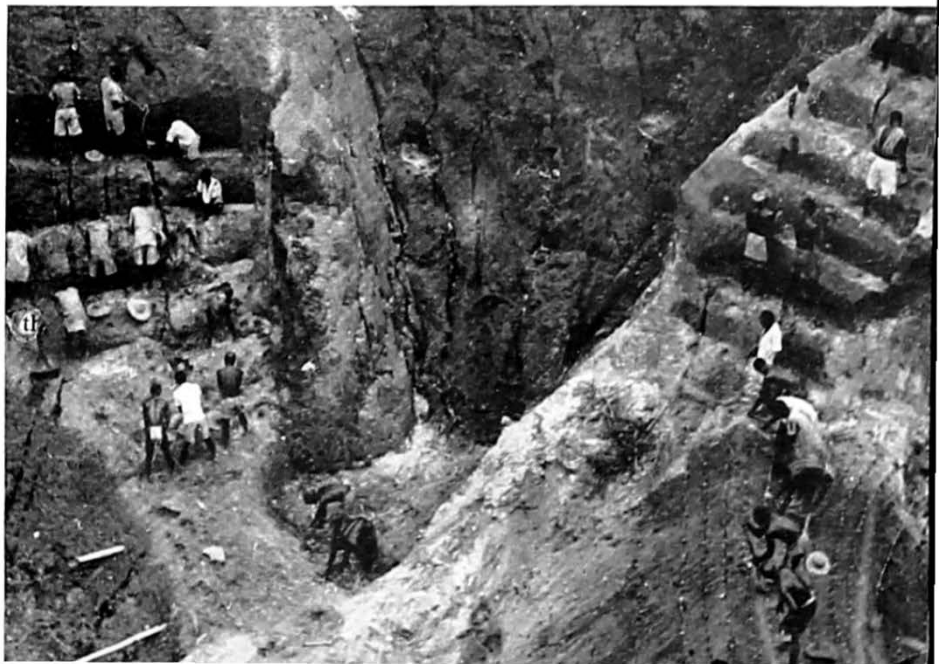
*Checking erosion by constructing earthworks and terracing in Onitsha Province, Nigeria.