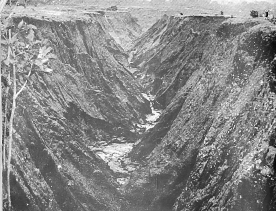
Effects of Soil Erosion in Onitsha Province, Nigeria.