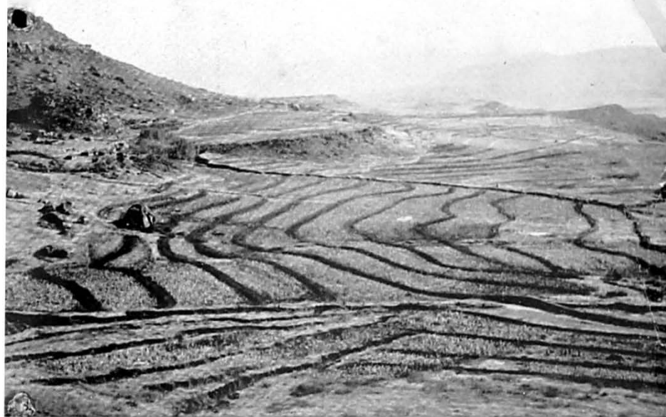
Land saved from soil erosion by terracing in Basutoland.