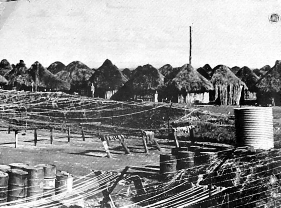
Huts alongside a corner of a sisal factory in Kenya