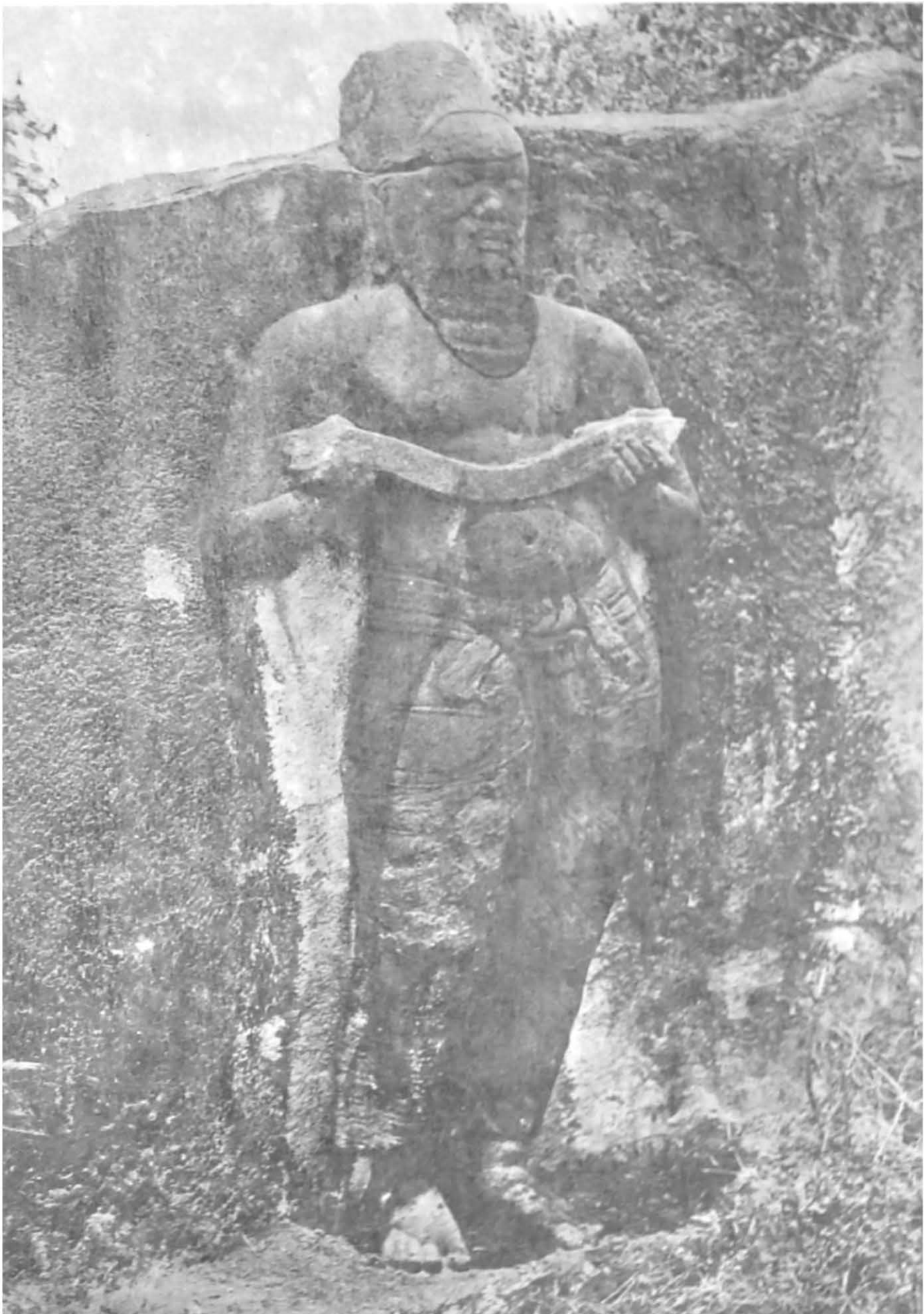
FIGURE OF A TAMIL SAINT. CEYLON.