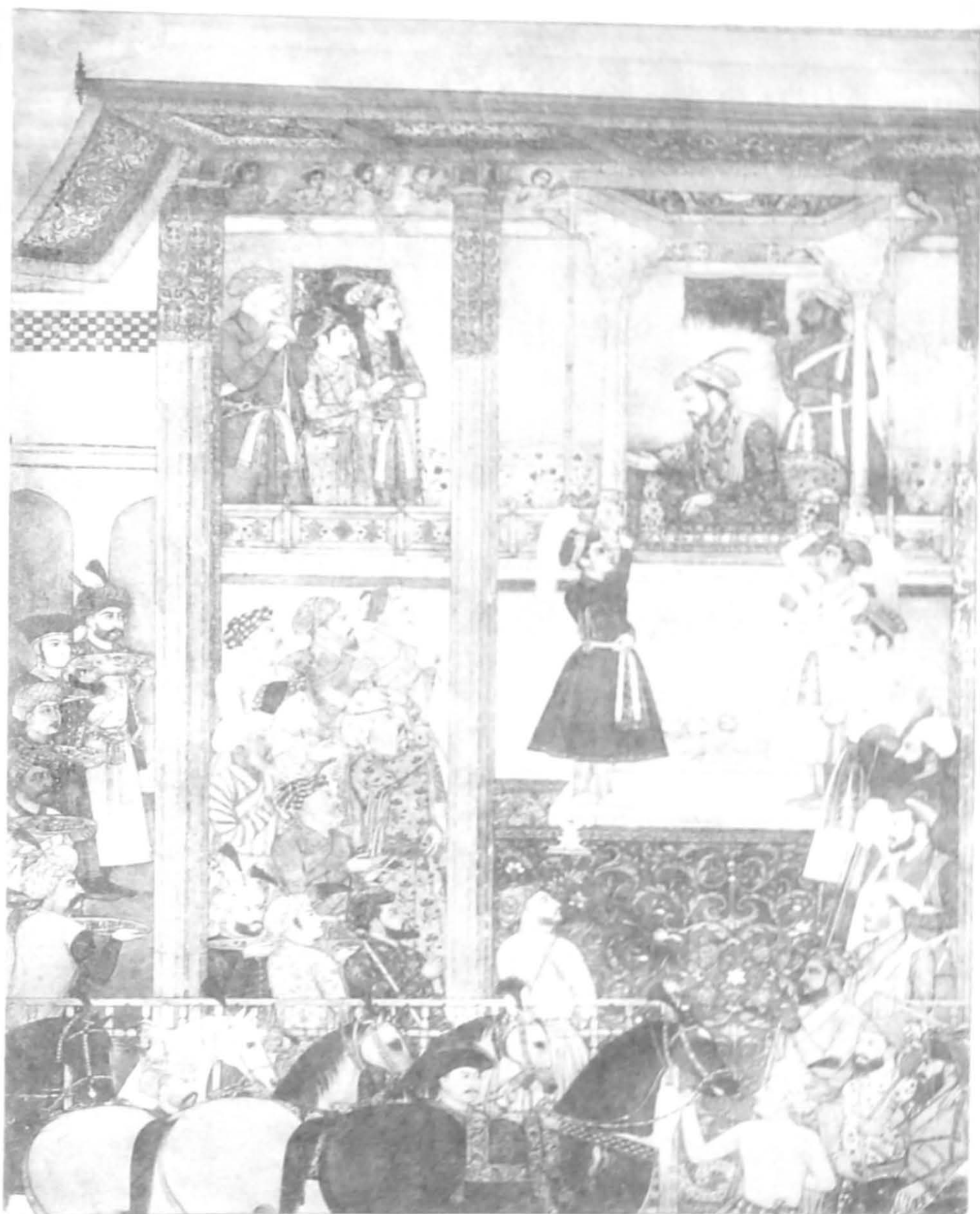
PERSIAN EMBASSY AT THE COURT OF JAHĀNGĪR MUGHAL SCHOOL.