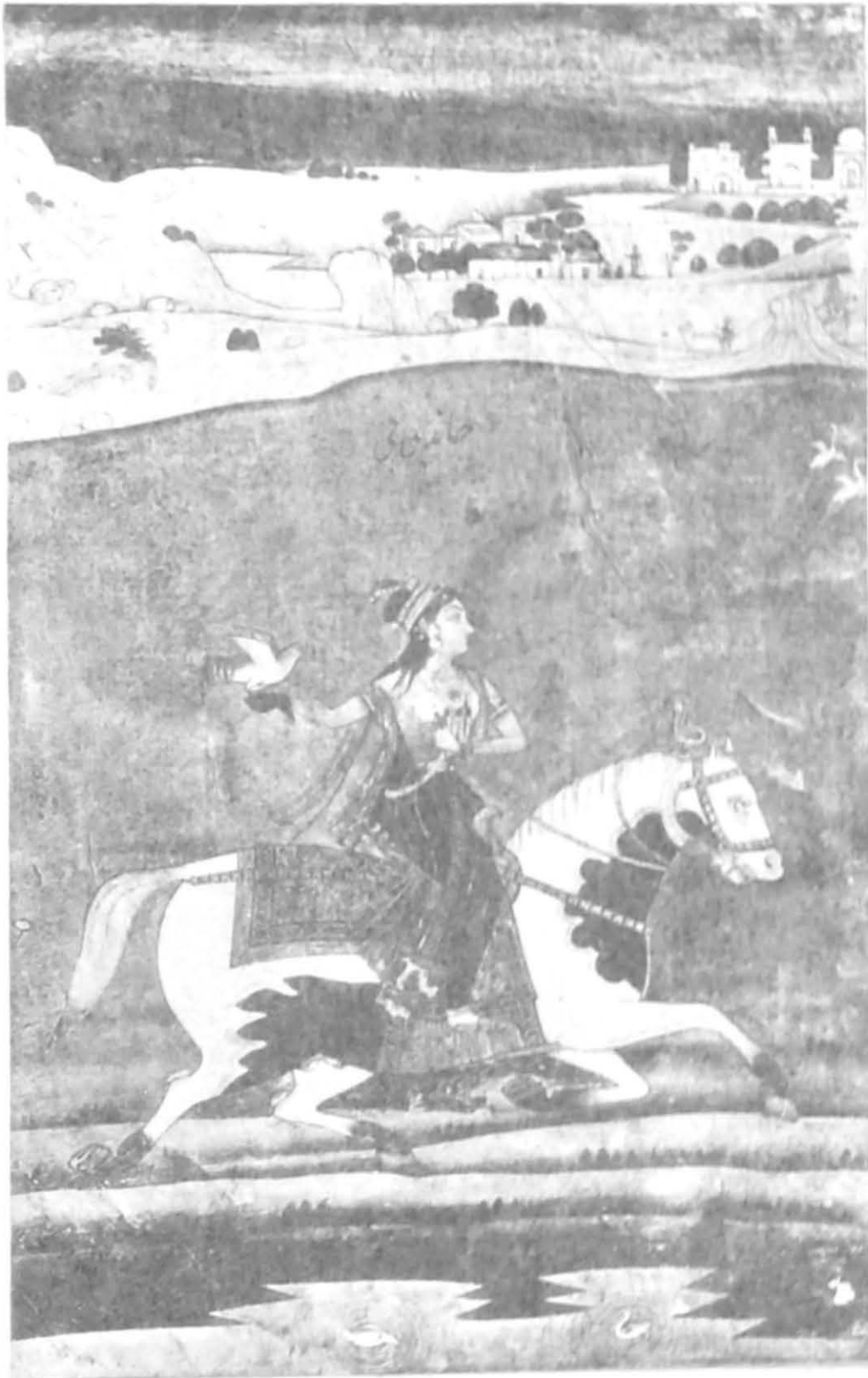
CHAND BIBI. RĀJPŪT SCHOOL.