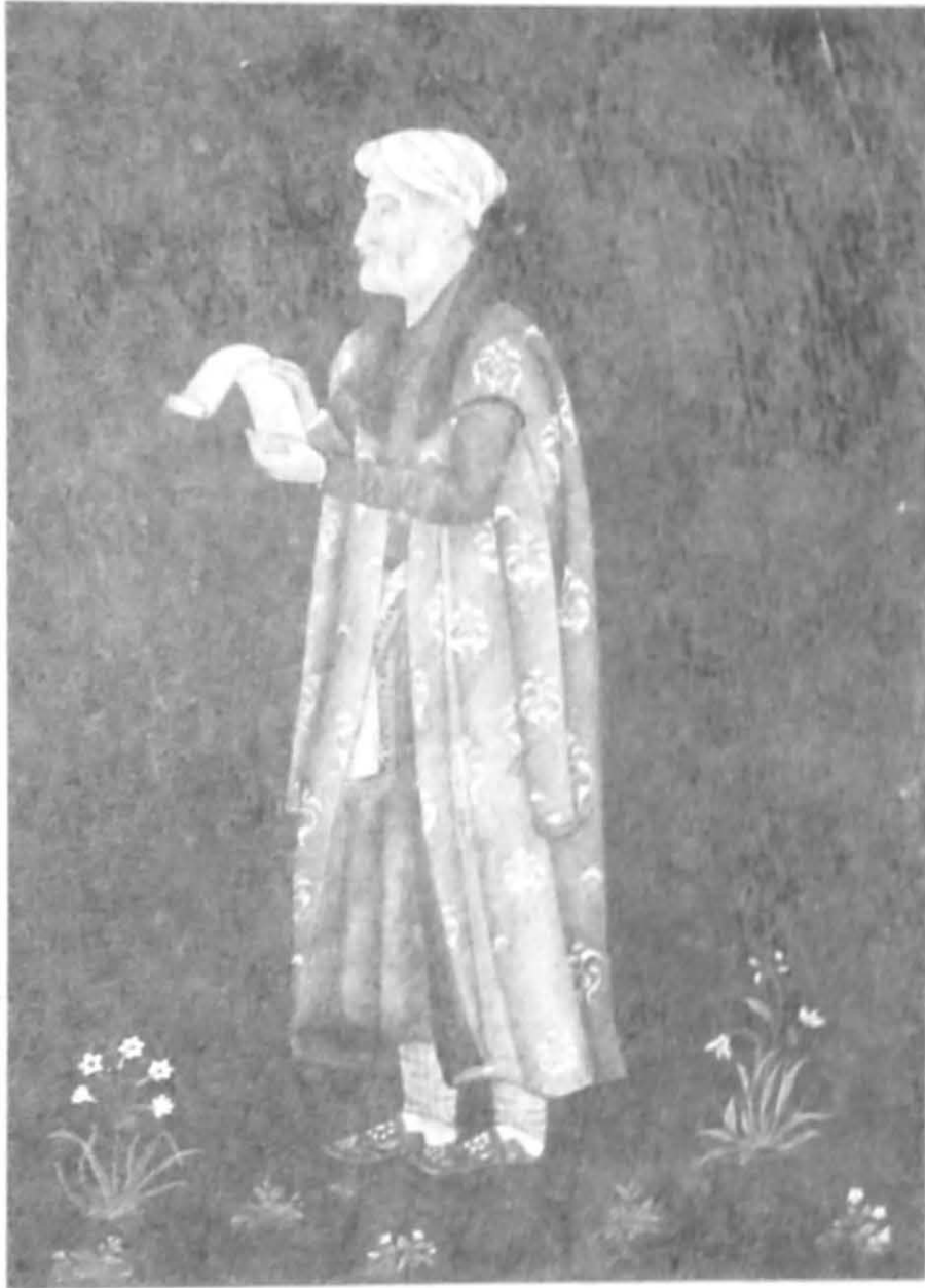
PORTRAIT OF A WRITER. MUGHAL SCHOOL.