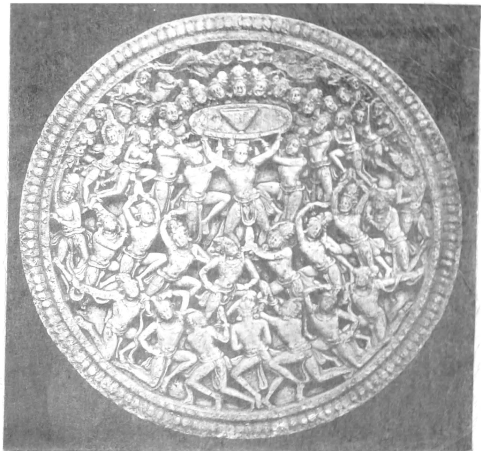
ELEVATION OF THE BOWL RELIC. AMARĀVATI.