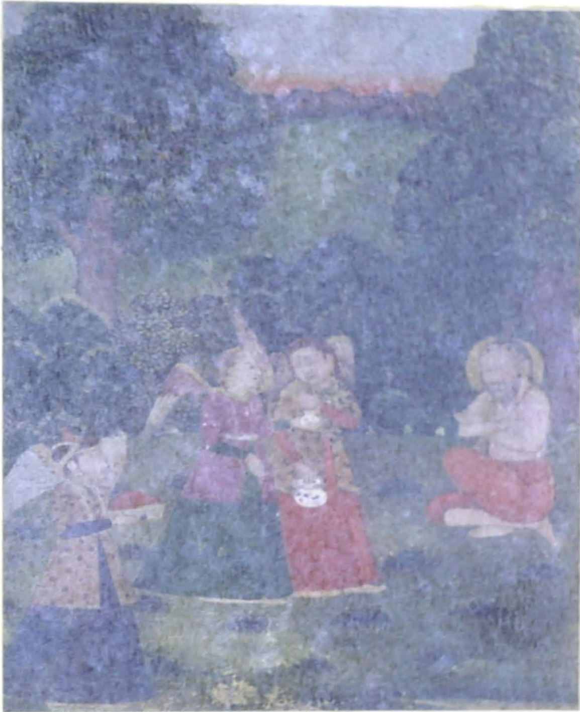
IBRĀHĪM B. ADHAM. MUGHAL SCHOOL.