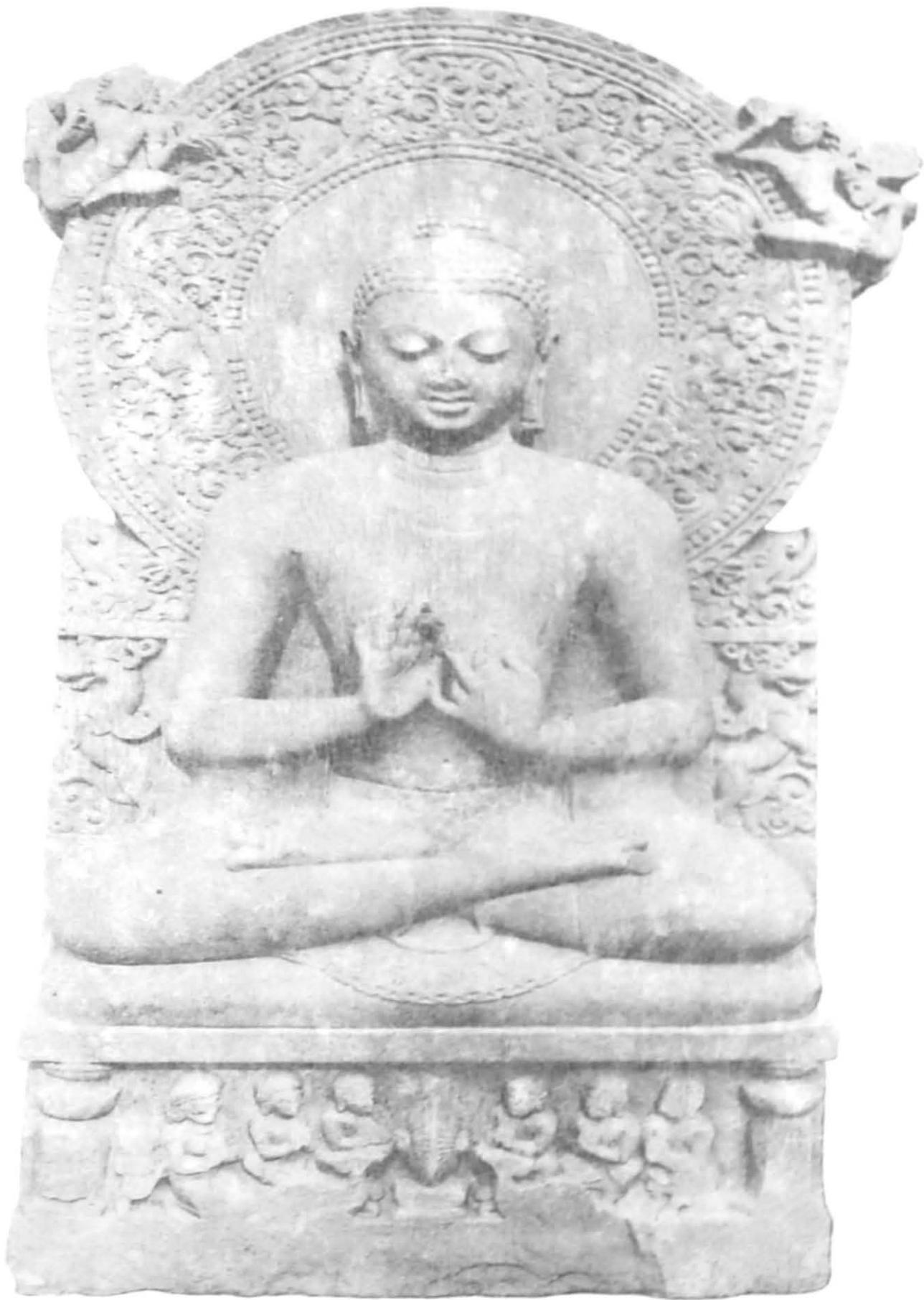
GAUTAMA BUDDHA. SĀRNĀTH.