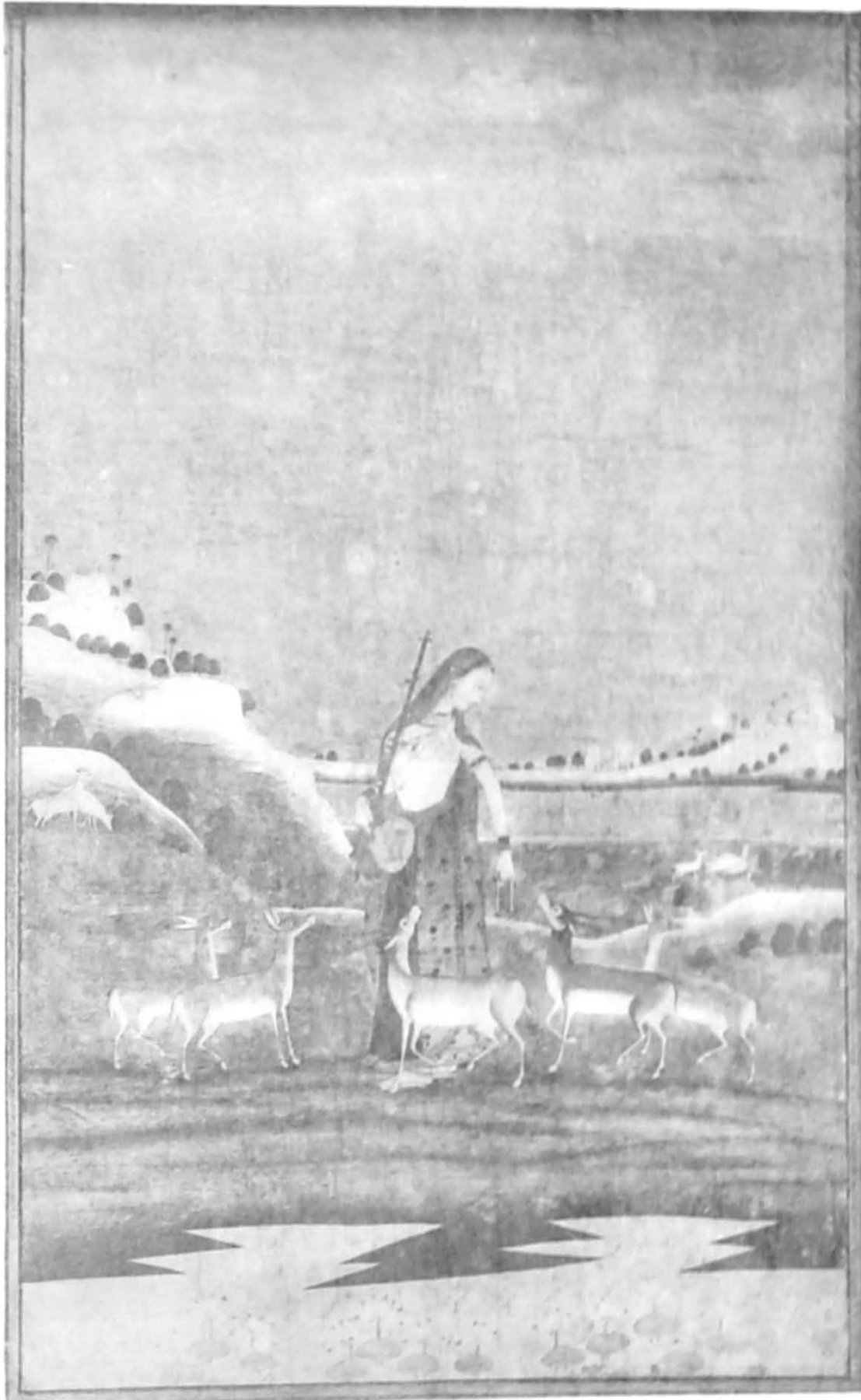
RĀGINĪ TORĪ. RĀJPUT SCHOOL.