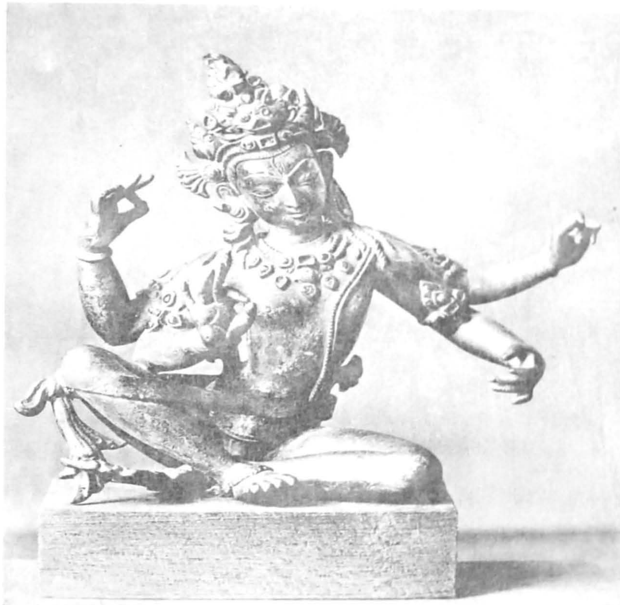
MAHĀYĀNA BUDDHIST FIGURE. NEPAL.