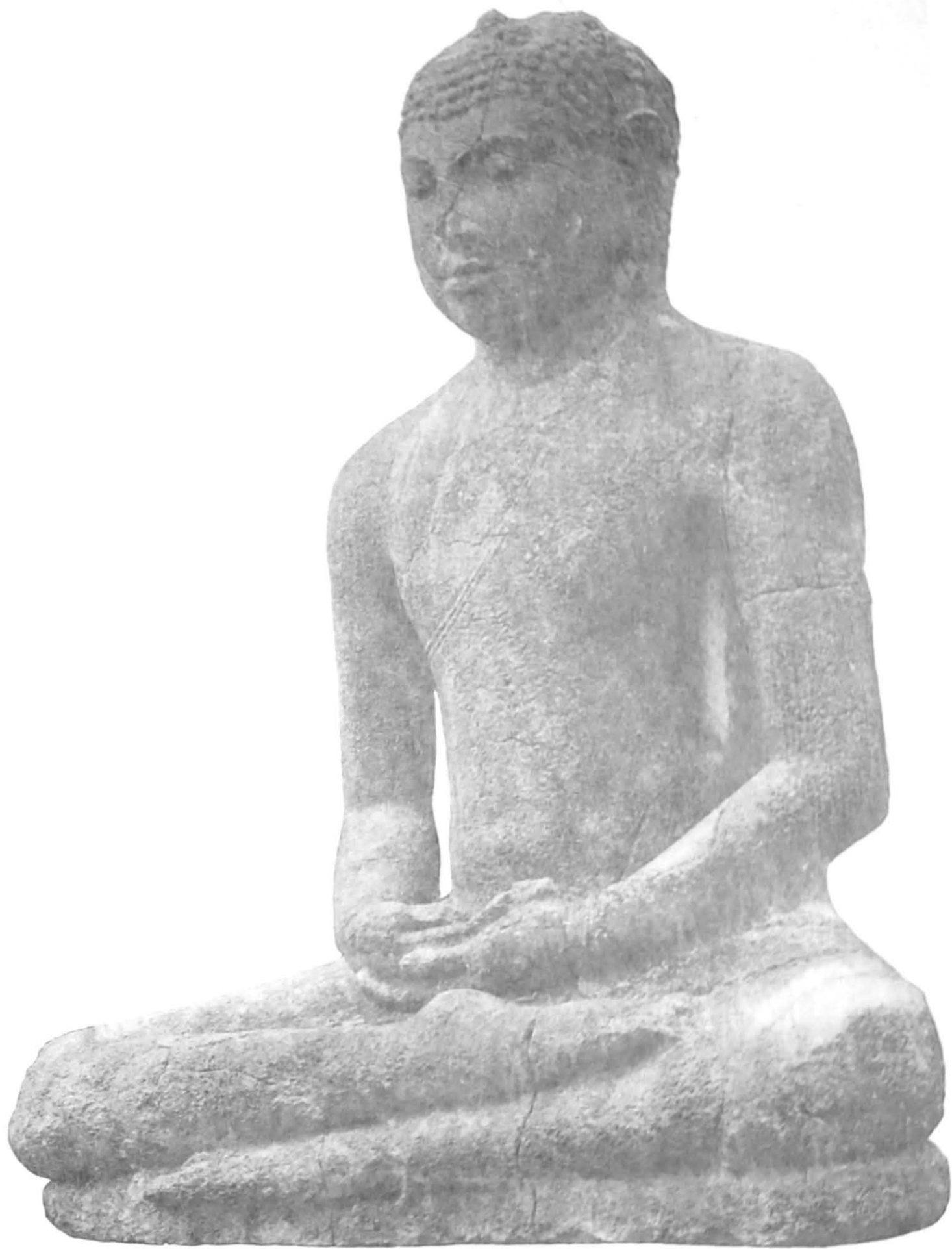
GAUTAMA BUDDHA. CEYLON.