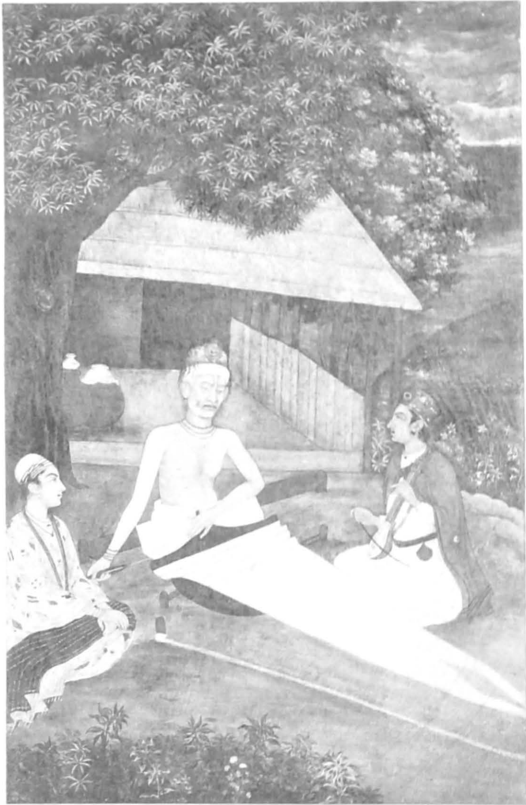
KABĪR. RAJPŪT SCHOOL, LATE COPY.