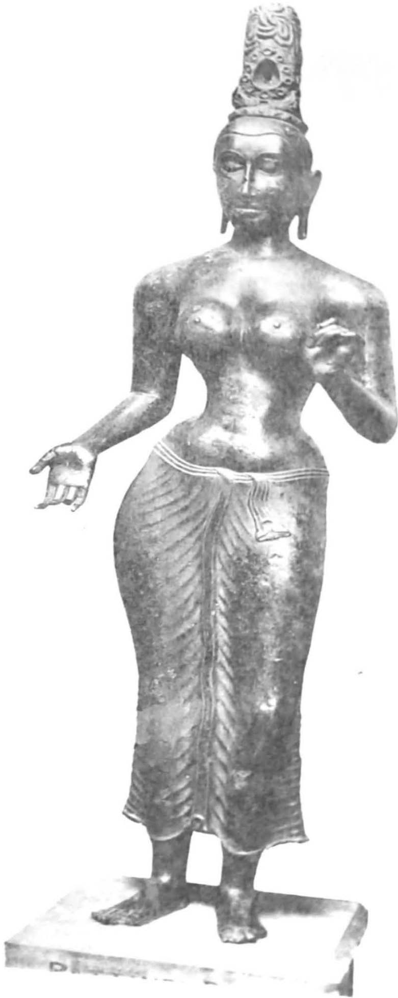
PATTINI DĒVĪ CEYLON.