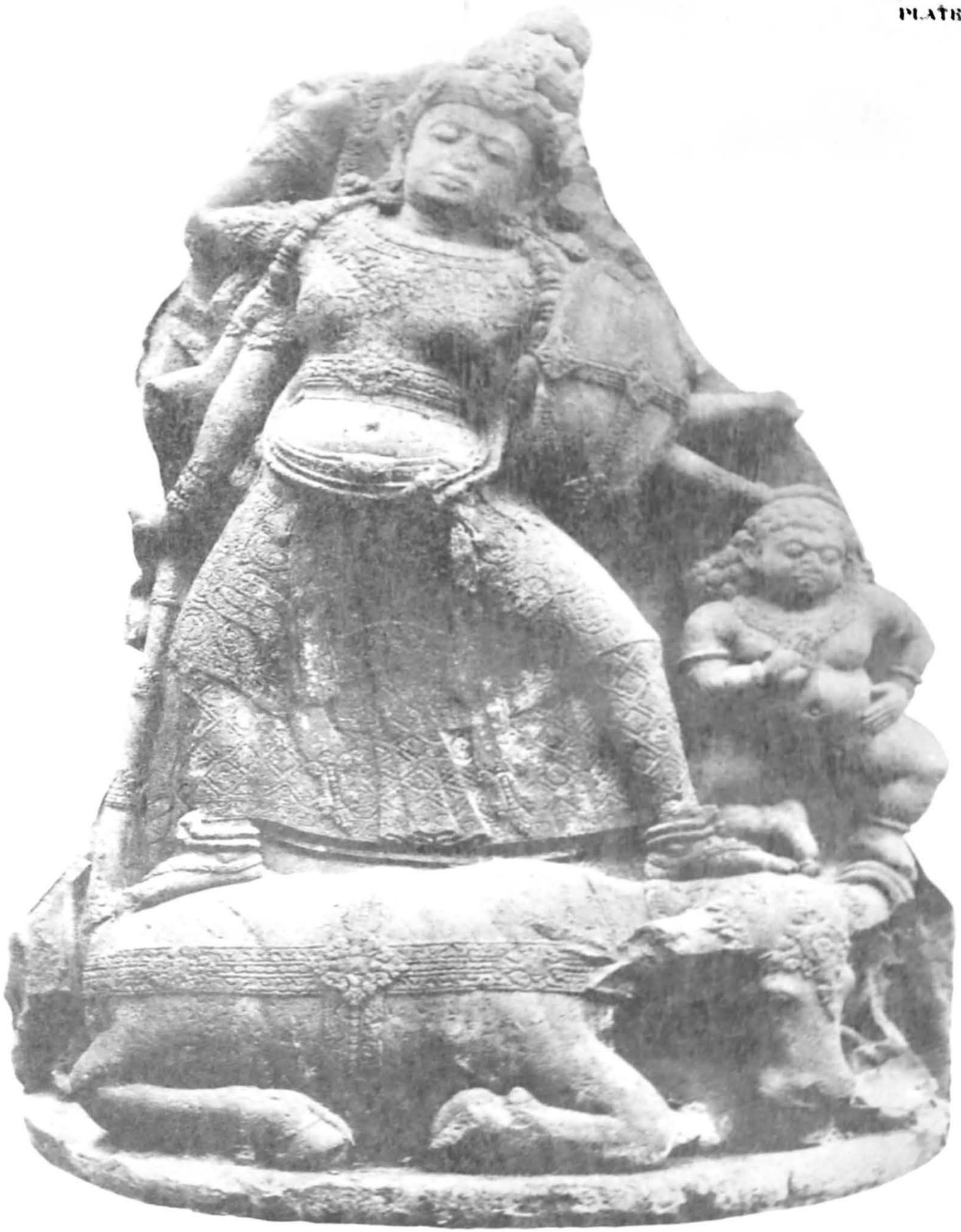
DURGĀ AND MAHIṢASURA. JAVA.