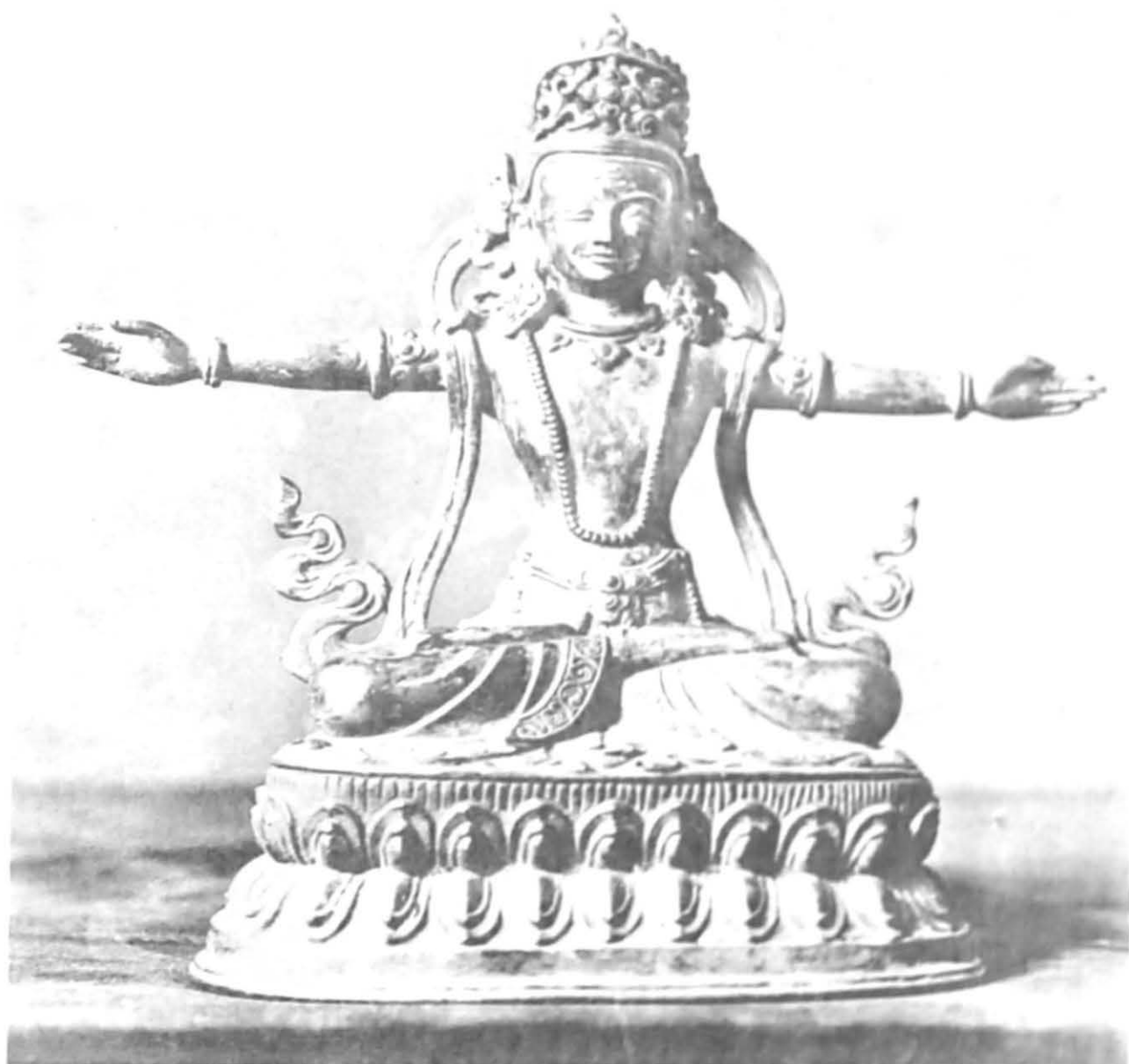
MAHĀYĀNA BUDDHIST FIGURE. NEPAL.