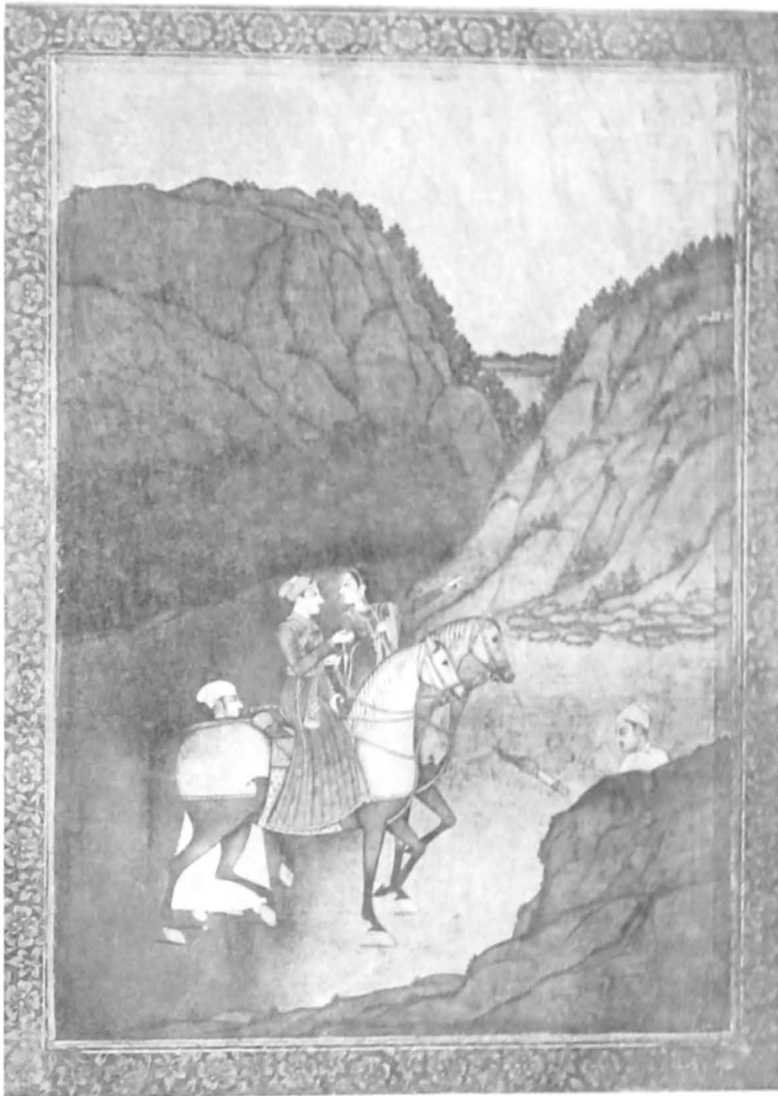
BĀZ BAHĀDUR AND RŪPMATI. RĀJPUT SCHOOL.