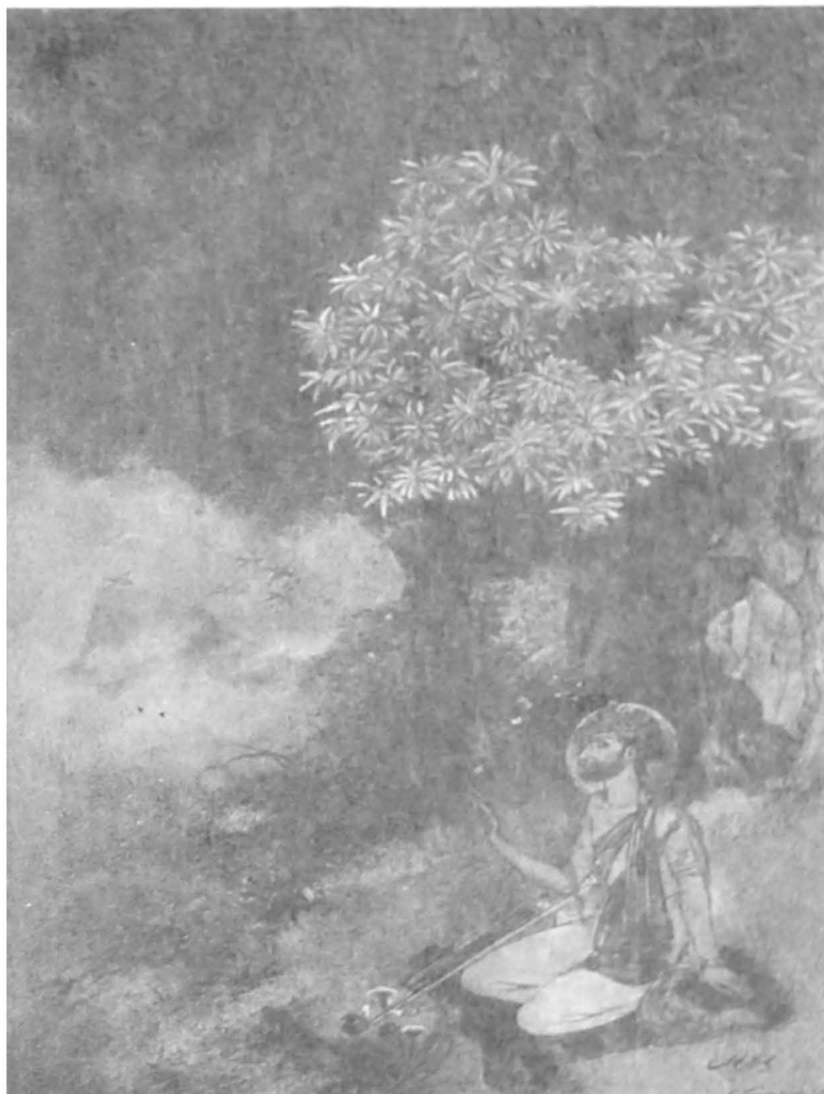
THE BANISHED YAKSHA BY ABANINDRA NATH TAGORE.