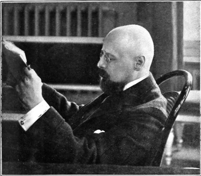
M. PURICHKEVITCH (Concerned in the murder of Rasputin.)