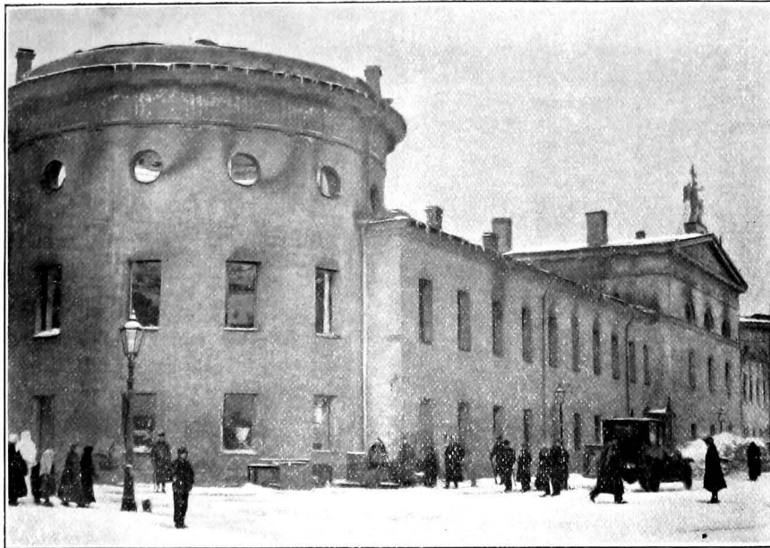
A STATE PRISON (LE CHÂTEAU DE LITHUANIE) AFTER IT HAD BEEN SACKED AND BURNT.