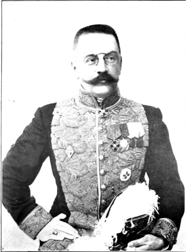
THE MINISTER MAKLAKOF ("The Love-Sick Panther.")