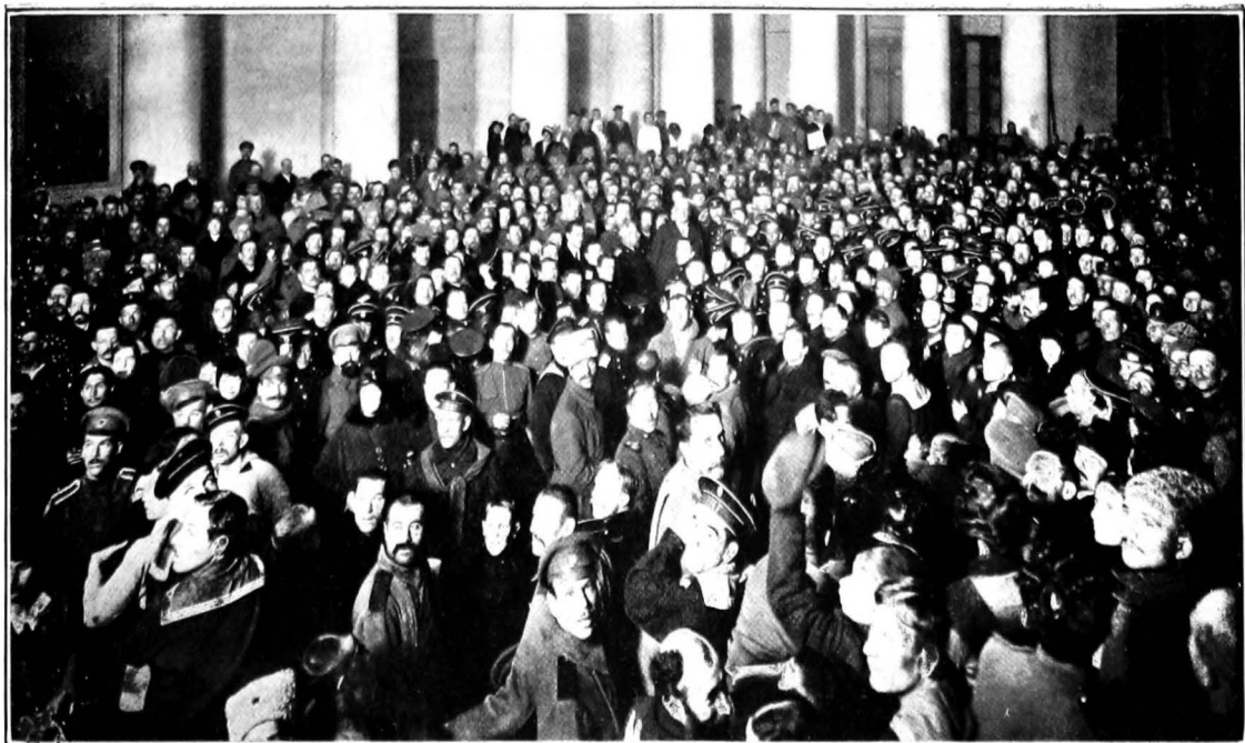
MEETING OF SOLDIERS IN THE DUMA BUILDING IN THE FIRST DAYS OF THE REVOLUTION.