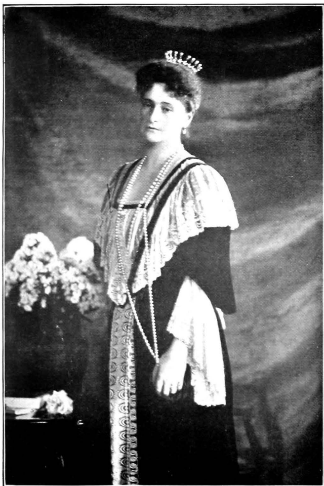
THE EX-EMPRESS ALEXANDRA FEODOROWNA.