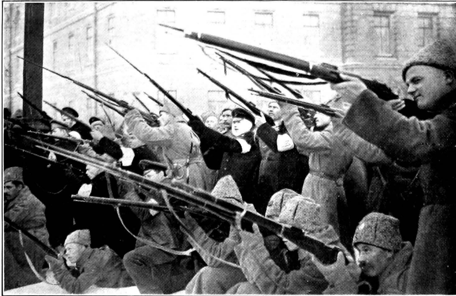
NATIONAL MILITIA FIRING ON A HOUSE SUSPECTED OF HARBOURING POLICE, DURING THE REVOLUTION.