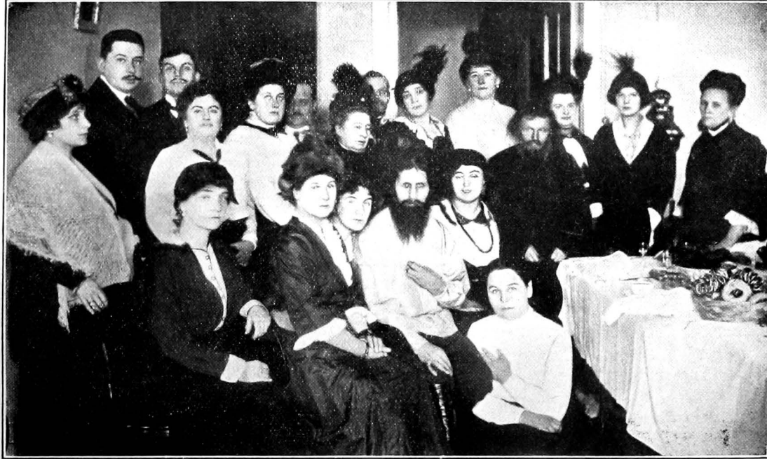
RASPUTIN WITH SOME OF HIS ADEPTS (Rasputin in the centre)