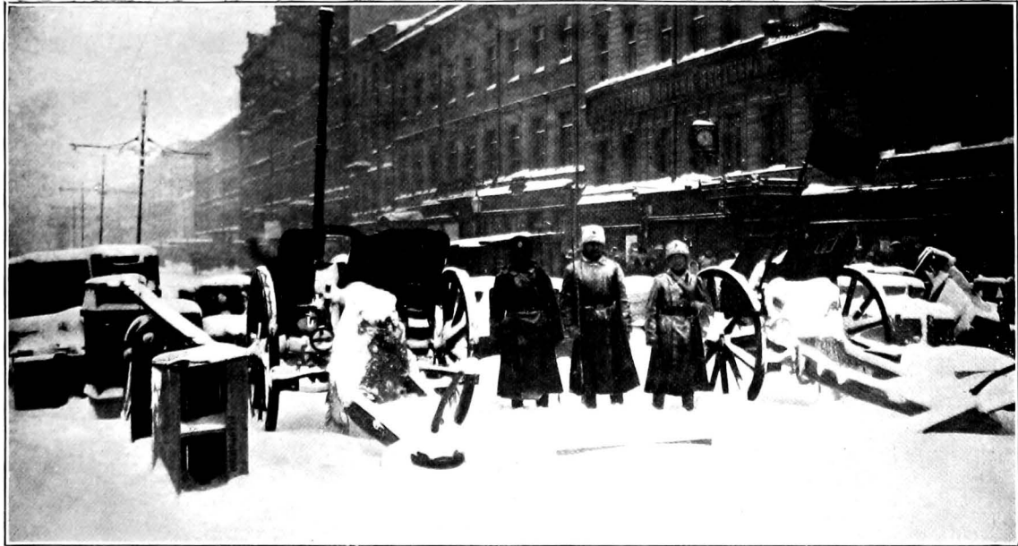
BARRICADES AND GUNS ON THE LITEYIN PROSPEKT.