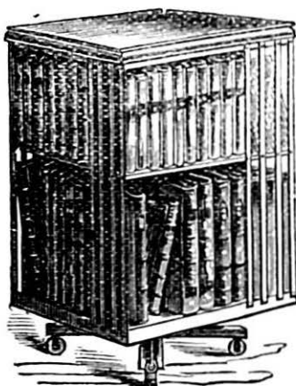
Size No. 1, 36 inches high.

The Revolving Bookcase will be found a great convenience by those who wish to have from 80 to 200 volumes accessible while seated at a table or by the fireside. This bookcase occupies no more space than an ordinary whatnot, and can be wheeled from one part of a room to another. It is particularly suitable for Private Libraries, for Studies, and for the Consulting Chambers of Barristers, Physicians, &c.