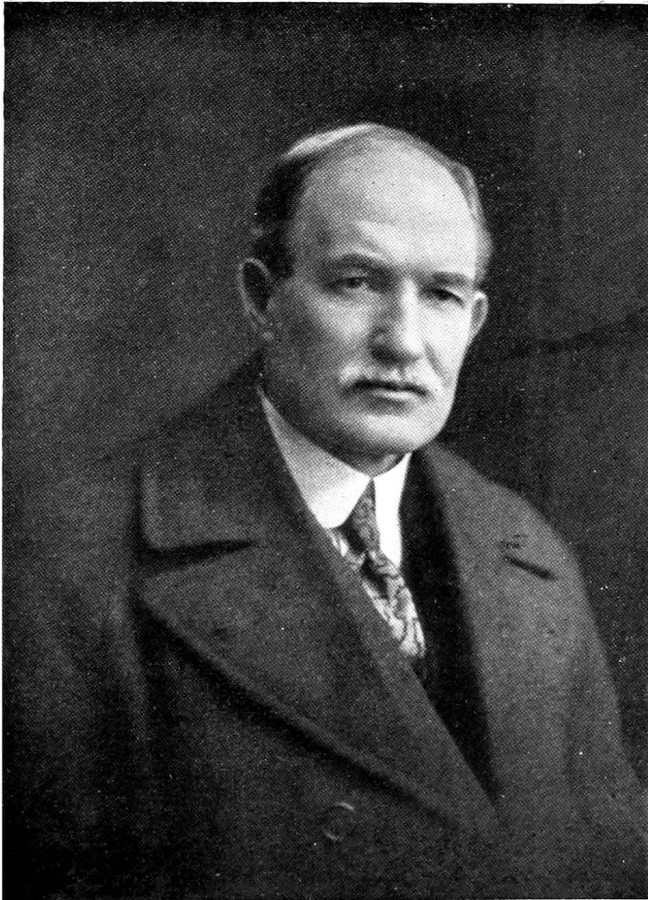
SIR MURDOCH MACDONALD