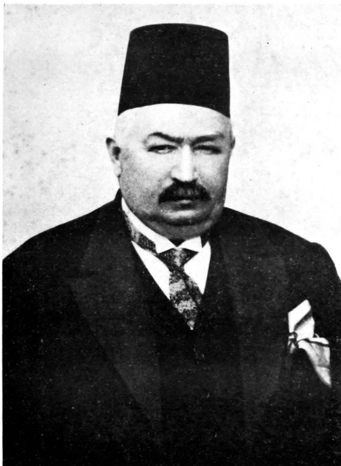
AHMED PASHA ZIWER