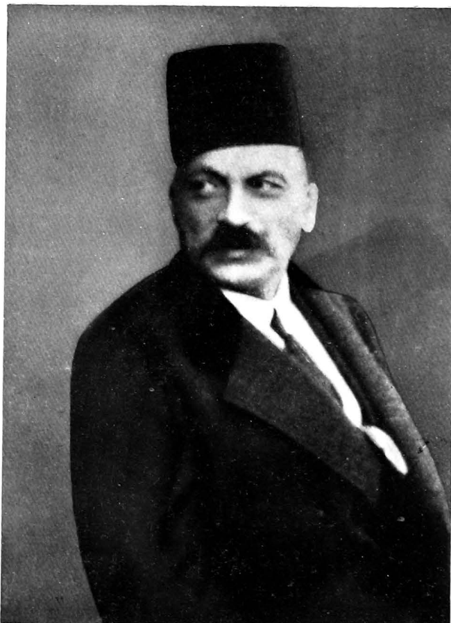
ADLY PASHA YEGHEN