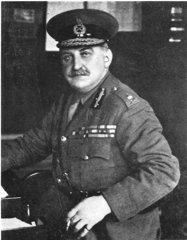
GENERAL SIR JOHN MAXWELL