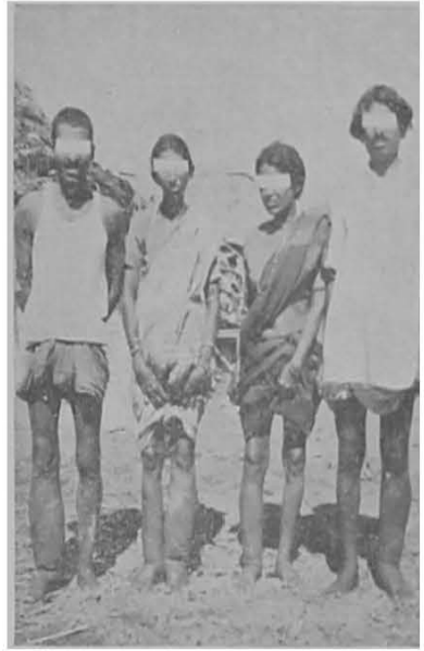
Swelling of the legs : Elephantiasis due to Wuchereria infections.