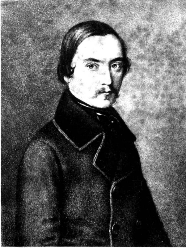
Prince Chlodwig of Hohenlohe-Schillingfürst in the year 1846