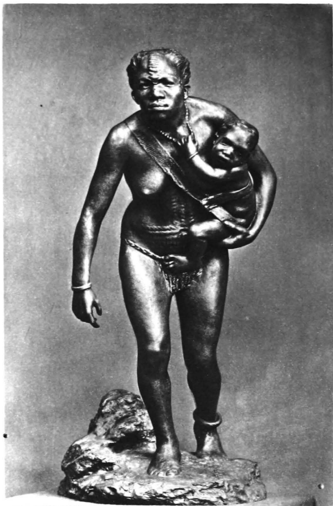
Motherhood. Bangala Woman and Child. From the Bronze by Herbert Ward.